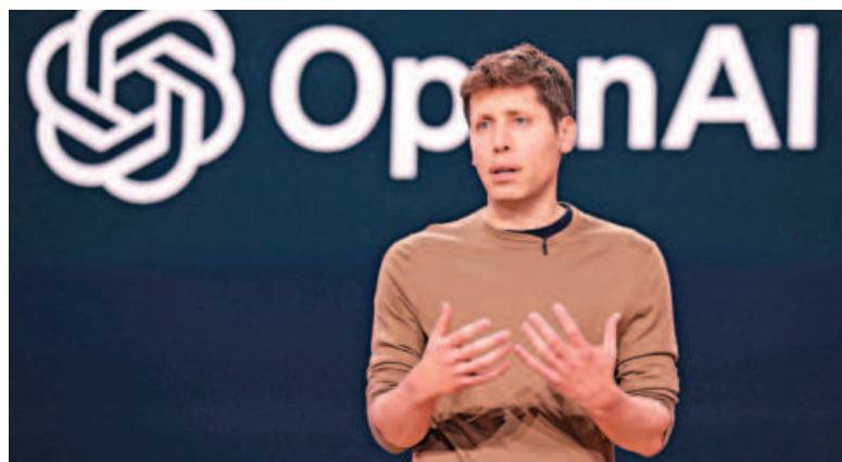
OpenAI CEO Sam Altman speaks at a conference in Seattle, Washington.

SoftBank and OpenAI are part of the Stargate drive announced by US President Donald Trump to invest up to $500 billion in artificial