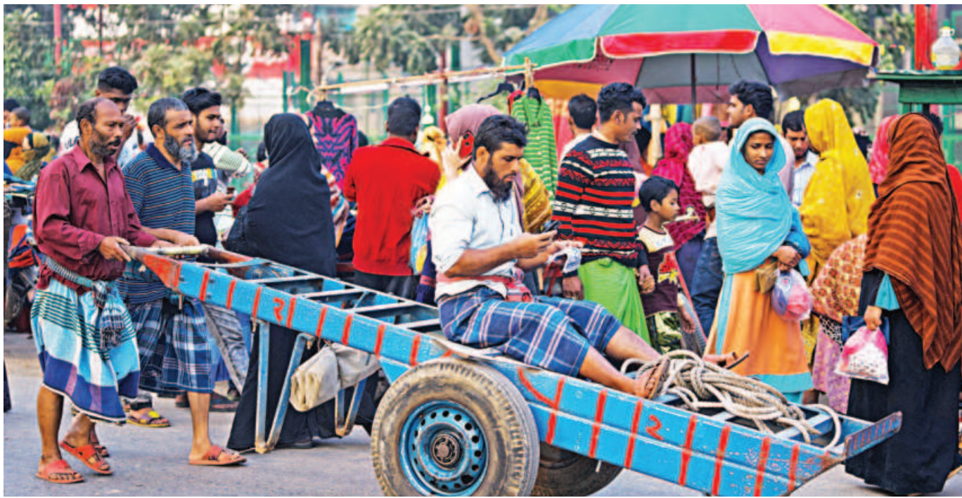
A man checks his phone while idling on a pushcart being driven by his colleagues through a street in Dhaka.

In 2017, following the government's decision to offer substantial tax benefits to encourage local manufacturing, Walton, a leading local manufacturer, produced just 40,000 smartphones, all of which were 3G devices.