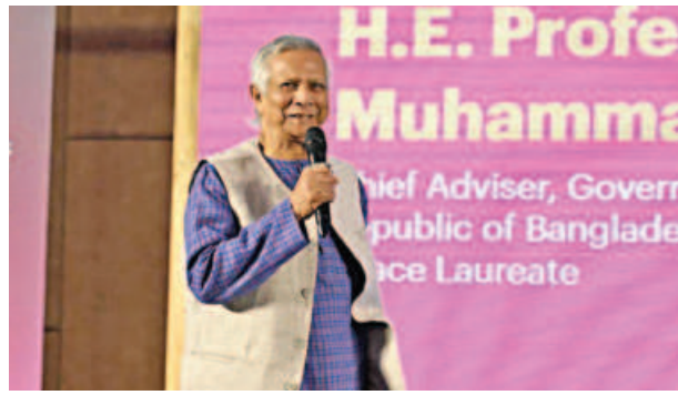
Chief Adviser Prof Muhammad Yunus speaks at the 9th Social Business Youth Summit at the InterContinental Dhaka yesterday.