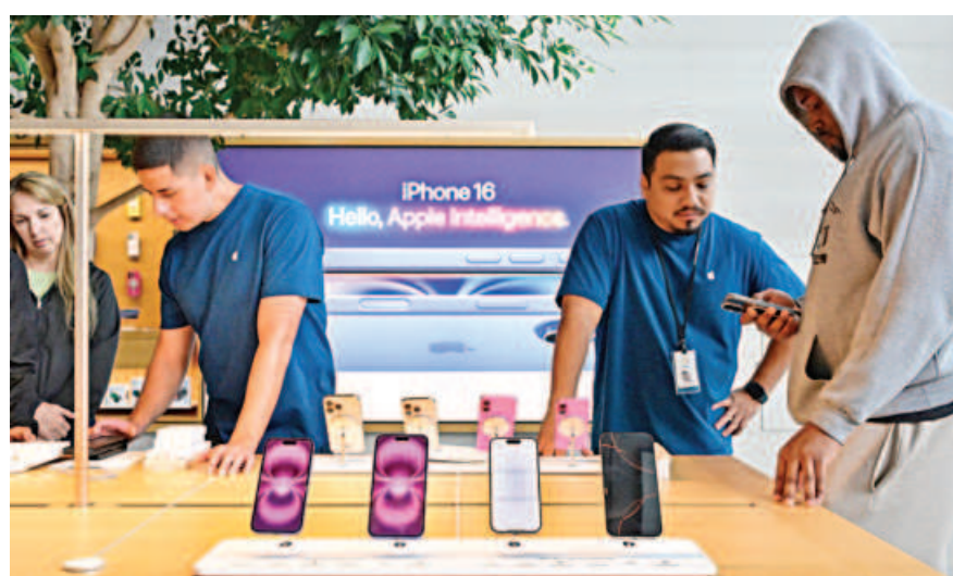
The new Apple iPhone 16 models are on display upon release on September 20, 2024 at the Apple Store at The Grove in Los Angeles, California.

Apple pushed out a software update in mid-January which disabled news headlines and summaries generated using AI that were lambasted for getting facts wrong.