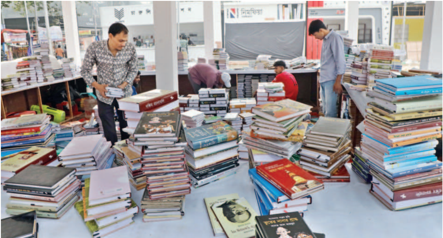
Book sellers are busy preparing a stall as Amar Ekushey Boi Mela begins today at Suhrawardy Udyan in the capital. The month-long book fair is arranged by Bangla Academy in February every year, commemorating the martyrs of the 1952 Language Movement. Chief Adviser Prof Muhammad Yunus is scheduled to inaugurate the event this afternoon.