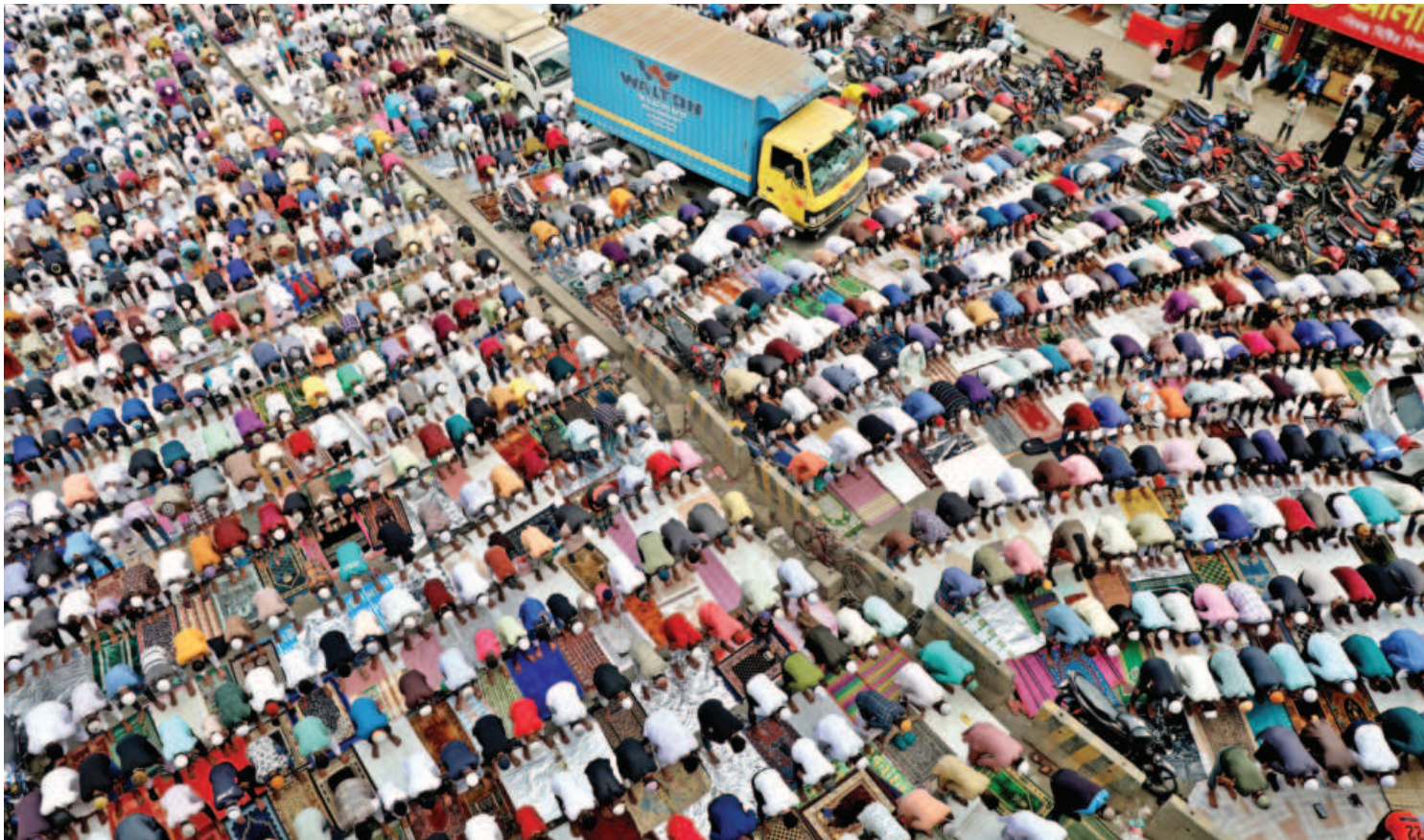
People offering Juma prayers in the Tongi Station Road area as the gatherings of devotees spill onto roads from the Tongi Ijtema ground. The first phase of the six-day Biswa Ijtema began on the banks of the Turag yesterday. Devotees from home and abroad have thronged there to take part in the Ijtema.