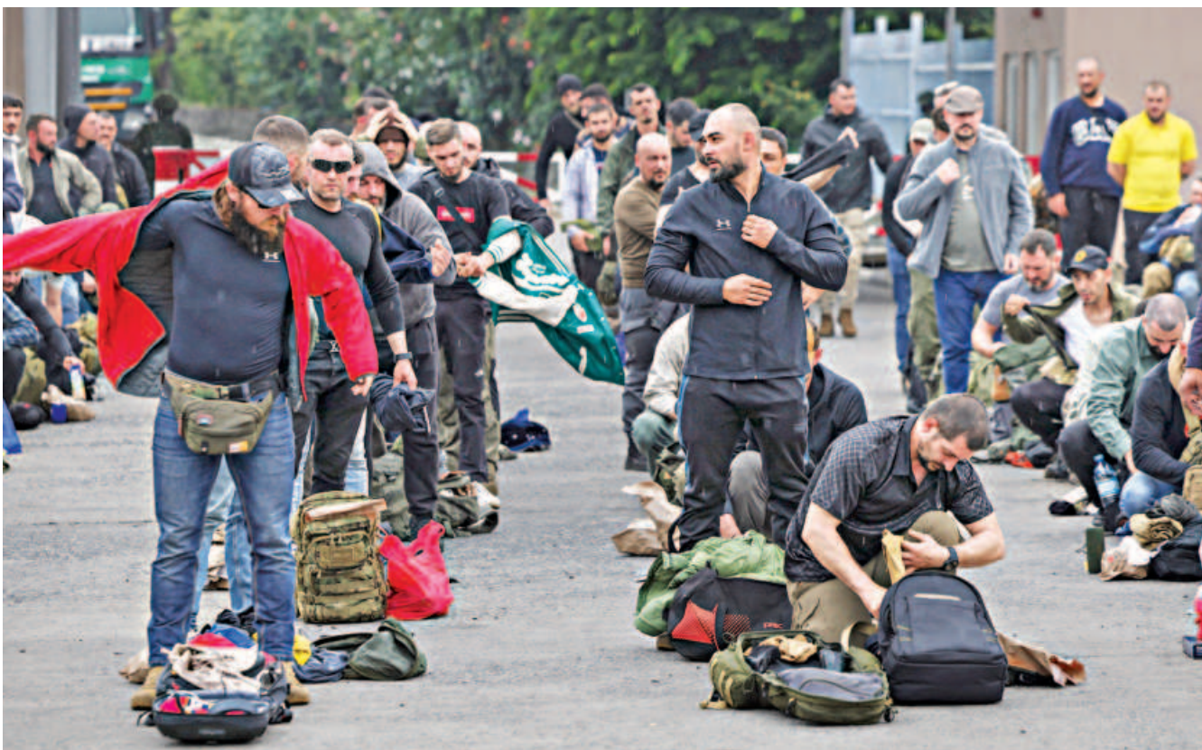
Men believed to be Romanian military contractors lined up to undergo a security inspection before crossing the border into Rwanda at the La Corniche Border Post in Gisenyi, Rwanda, yesterday. Rwanda-backed fighters controlled most of the besieged DR Congo city of Goma as residents slowly emerged from their homes after days of deadly fighting in the key mineral trading hub.

Israel has not yet fully withdrawn its forces from southern Lebanon and said it will keep operating against any threat posed to the state of Israel and its citizens.