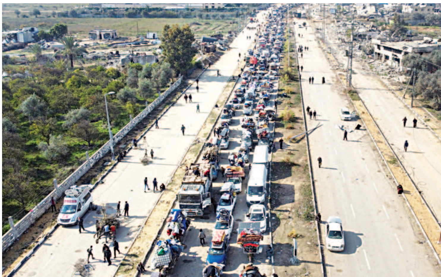
A drone view shows displaced Palestinians waiting for their vehicles to be inspected by the Egyptian-Qatari committee as they return to their homes in northern Gaza from the south, at Salahudeen Road in the central Gaza Strip yesterday.