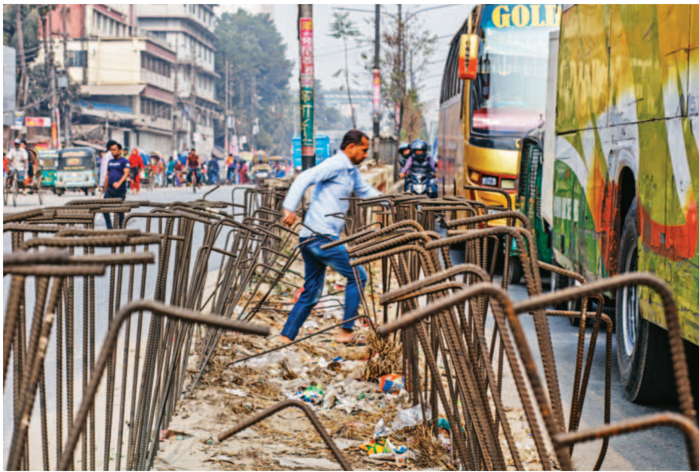
The construction of a median strip on Darus Salam Road in the capital's Mirpur-1 area has been left incomplete for around a year, putting pedestrians and vehicles at risk. This photo was taken on Monday.