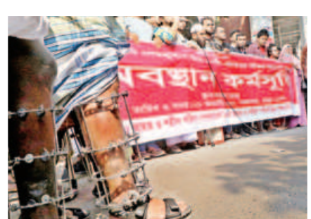
Survivors of the July uprising staged a protest at the capital's Shahbagh yesterday, demanding swift trials for those responsible for the atrocities during the movement, as well as lifetime access to quality treatment, rehabilitation, and employment opportunities for the injured.