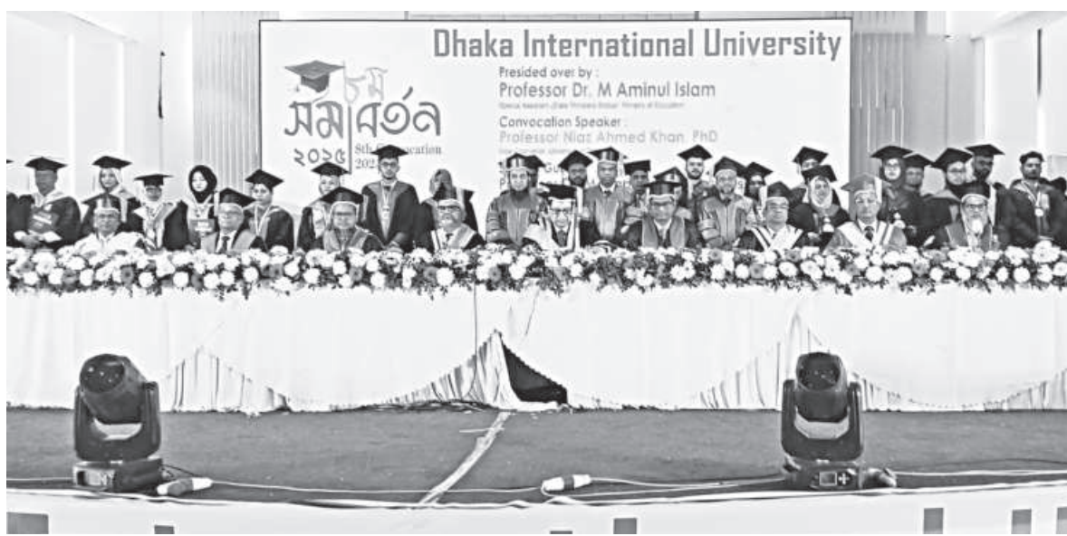
Graduates and guests at the 8th convocation ceremony of Dhaka International University at the PSC Convention Hall, Mirpur-14, yesterday.