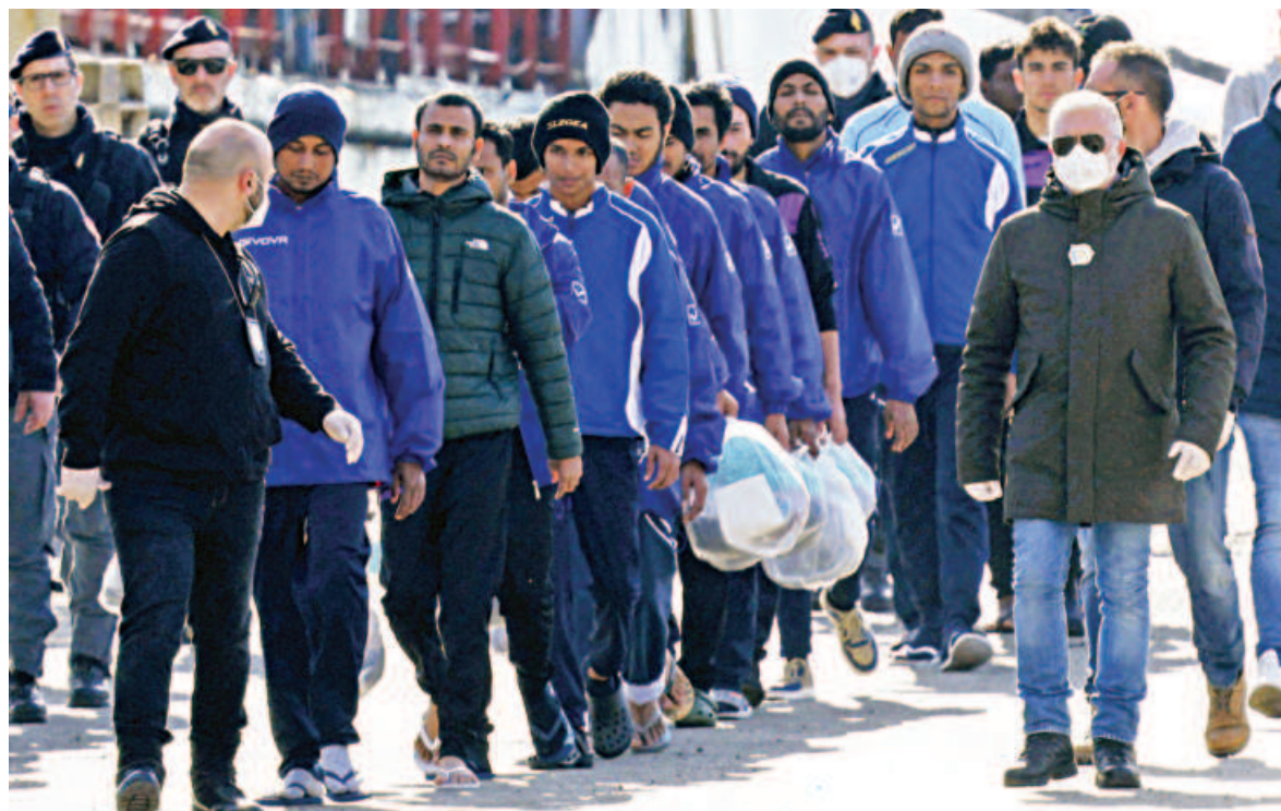
Migrants gather at the Albanian port of Shengjin yesterday, after disembarking from the Italian navy ship Cassiopea, which arrived in Albania as part of a deal with Italy to process thousands of asylum-seekers caught near Italian waters.

Modi's visit to Washington was discussed