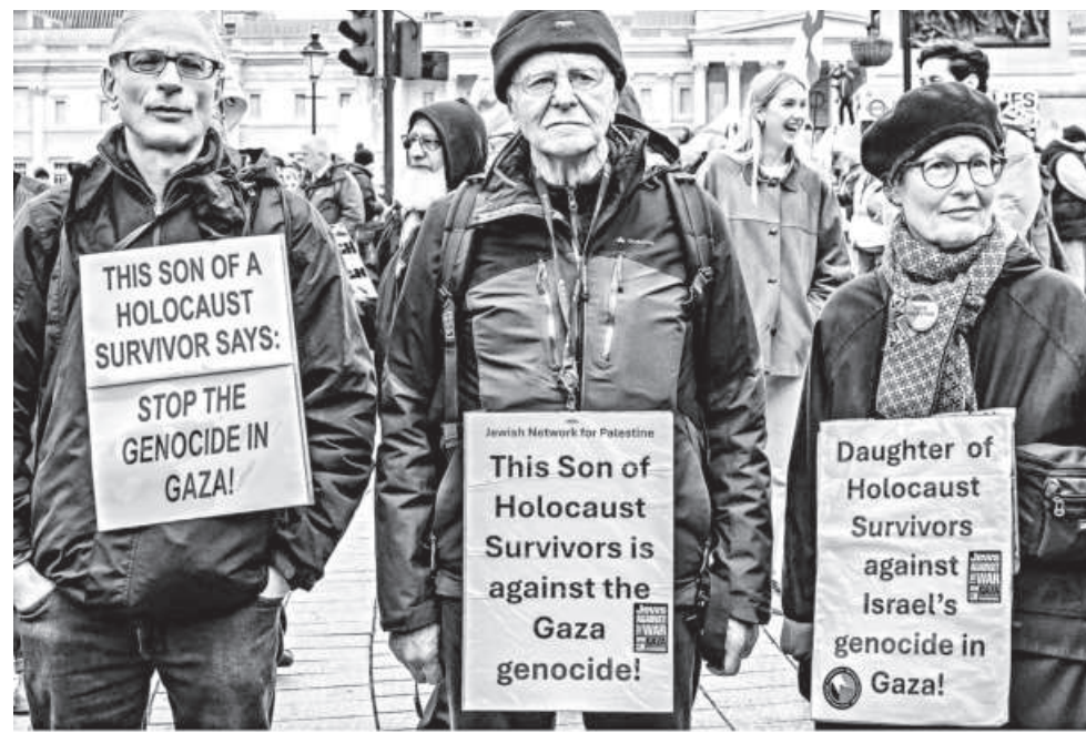
Children of Holocaust survivors protest against the genocide in Palestine.

Deborah Feldman, American-German writer of Unorthodox: The Scandalous Rejection of My Hasidic Roots , wrote about how pro-Israel political consensus in Germany shut out her dissenting voice as a Jew criticising Israel. Raised by Holocaust survivors, Feldman writes in the essay, "the only legitimate lesson to be learned from the horrors of the Holocaust," is "the unconditional defence of human rights for all, and that simply by applying our values conditionally we are already delegitimising them."