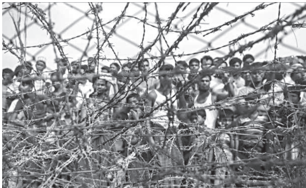
Rohingya refugees gather behind a barbed-wire fence in a temporary settlement set up in a "no man's land" border zone between Myanmar and Bangladesh.

Politically, the AA, as the United League of Arakan's (ULA) military wing, has established parallel governance in the areas it controls. It demonstrates a deep understanding of the need to synthesise military victories with political legitimacy, as seen in its efforts to weave a governance framework that