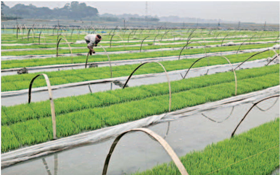
PHOTO: STAR Farmers cultivated hybrid Boro seedlings on vast areas using advanced plastic tray method. The photo was taken from Noakanda village in Narsingdi’s Palash upazila.

saplings from extreme cold and fog. Besides, the seedlings will be ready for transplantation within 20 to 25 days. Farmer Faruk Mia of the village said, “We only have to bear the irrigation and land preparation costs. All other steps, from preparing the seedbeds to transplanting, will be done under the supervision of the agriculture office.” The advanced method has not only reduced their expenses, but also made the process much easier, Faruk added. Another paddy grower Rahim Uddin said seedlings grown in the trays remain healthy even in adverse weather as the plastic sheets protect the seedbeds from cold and fog. The pilot initiative has also facilitated better coordination among farmers of the village, he further said. Palash Upazila Agriculture Officer (UAO) Ayesha Akter said cultivation of Boro saplings using the tray method is an innovative and eco-friendly approach, which saves both time and money. “We are providing training and necessary technical support to farmers to promote synchronized farming practices and hope it will open new possibilities for the agriculture sector in the coming years,” Ayesha said.