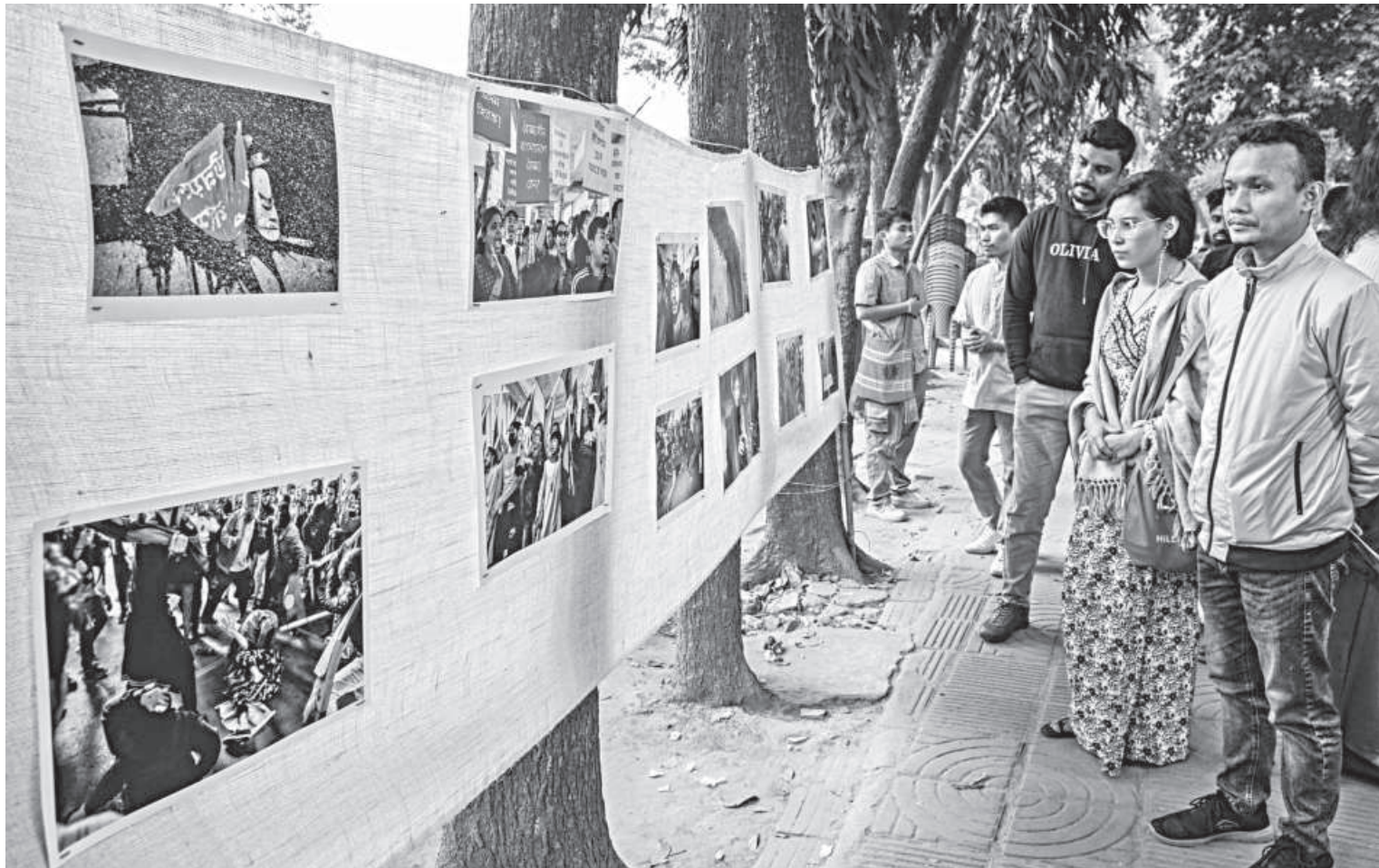
Bangladesh Indigenous Artist Unity held a cultural gathering at TSC on the Dhaka University campus yesterday, demanding constitutional recognition of the indigenous people, punishment for those attacked the community groups and rights activists, and reinstatement of the word “adivasi” along with the graffiti in textbooks.