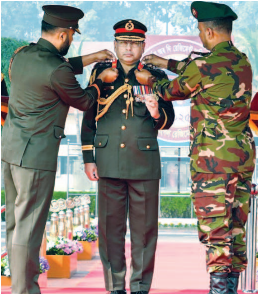
Chief of Army Staff General Waker-Uz-Zaman being adorned with the 17th “Colonel of the Regiment” of the traditional East Bengal Regiment in Chattogram Cantonment yesterday.