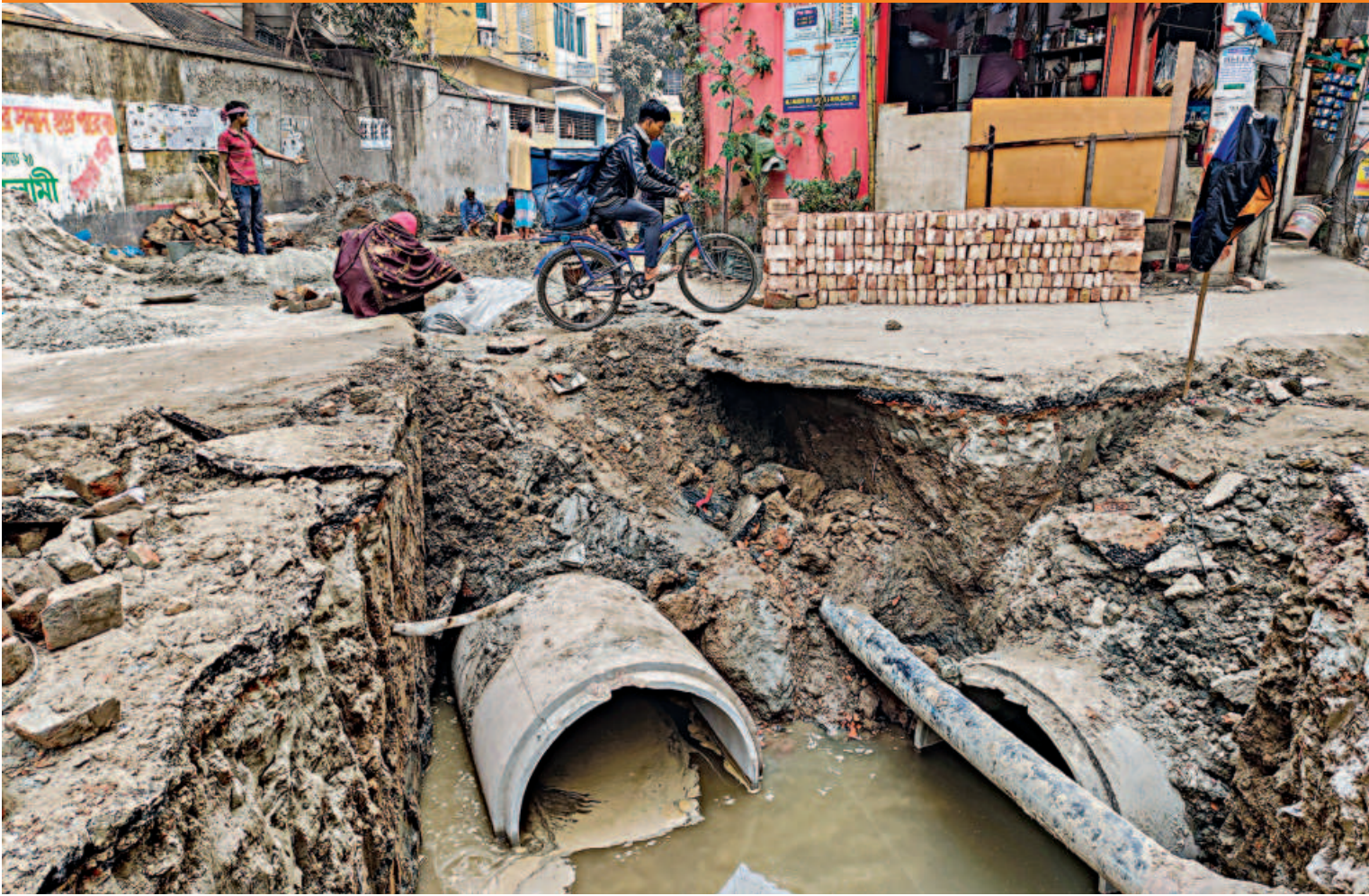
A boy rides a bike through a road dug up for drainage work in the Janata Housing area of Adabor yesterday. Despite the project running for over a week, there are no proper safety measures or barricades in place, putting pedestrians at risk.

The petition was filed by 10 SC lawyers.