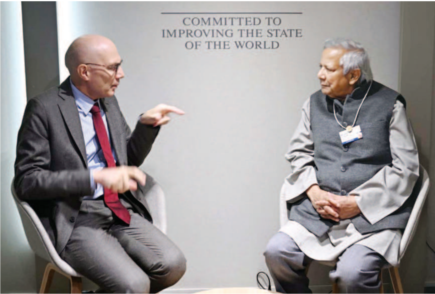
Chief Adviser Prof Muhammad Yunus talks to UN High Commissioner for Human Rights Volker Türk yesterday on the sidelines of World Economic Forum summit in Davos, Switzerland. Story on page 3.

The detainees are being investigated under Malaysian laws related to the absence of valid documentation and overstaying in the country, the report said. All those arrested were taken to the Kuala Lumpur Immigration Headquarters, the immigration official told reporters after the operation.