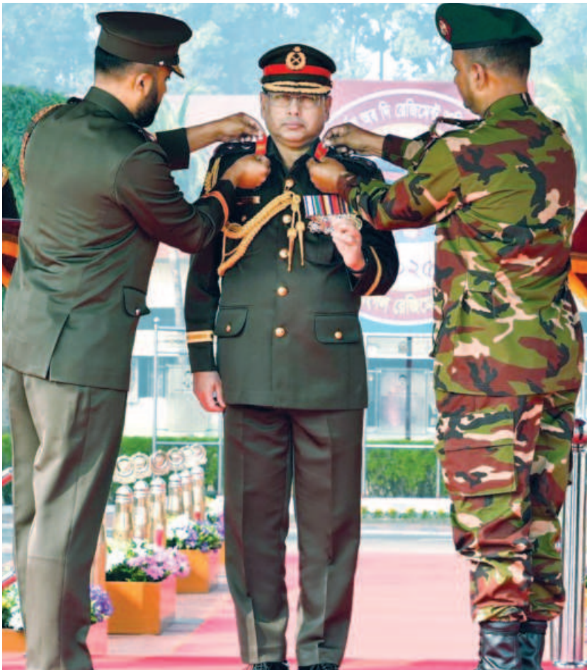
Chief of Army Staff General Waker-Uz-Zaman being adorned with the 17th "Colonel of the Regiment" of the traditional East Bengal Regiment in Chattogram Cantonment yesterday.