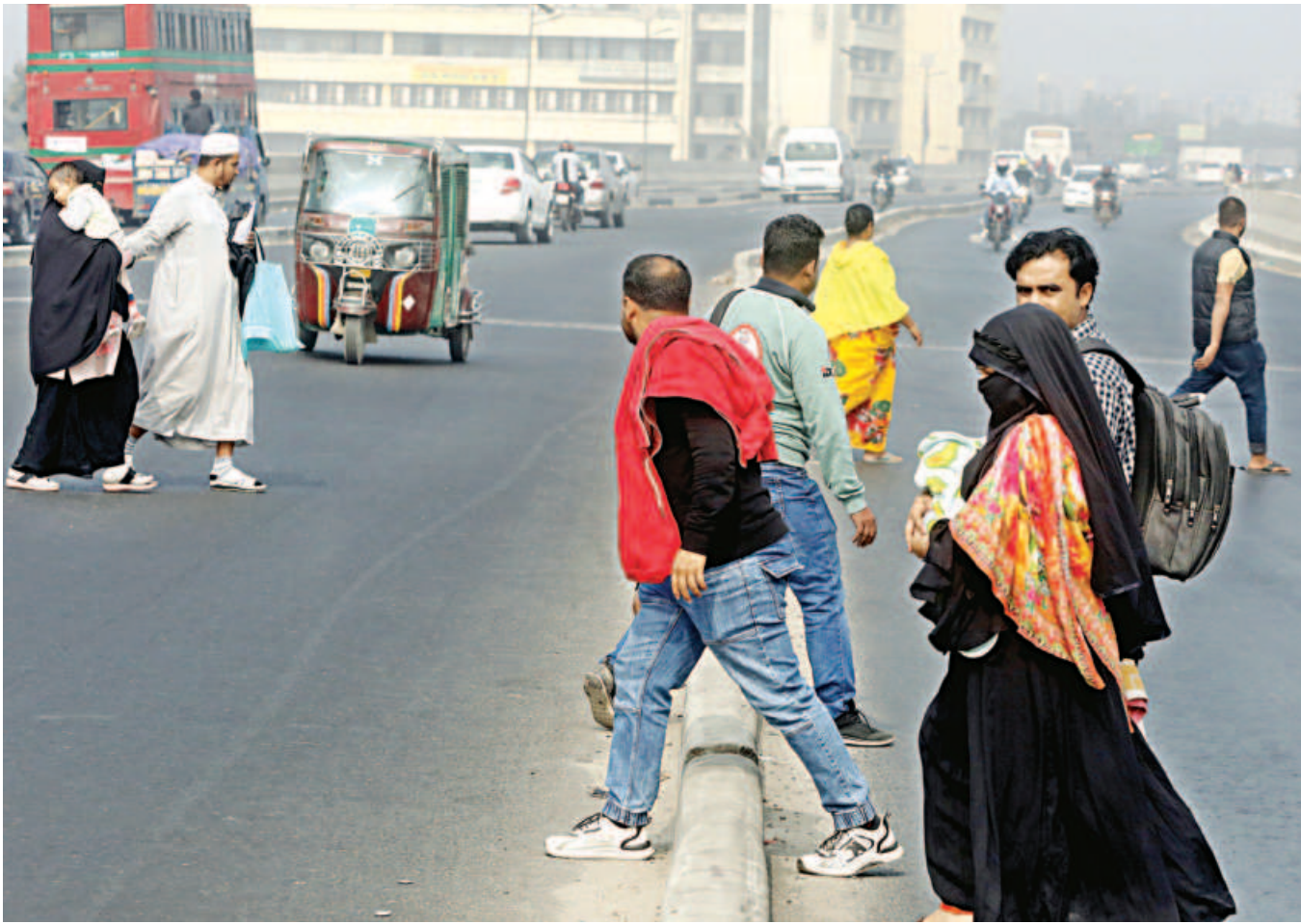
Risking life and limb, people cross the Tongi flyover. Buses frequently stop on the flyover to pick up and drop off passengers, blatantly ignoring a sign (not seen in the photo) that reads "No stopping here". This dangerous practice poses a serious risk to people. The photo was taken yesterday.