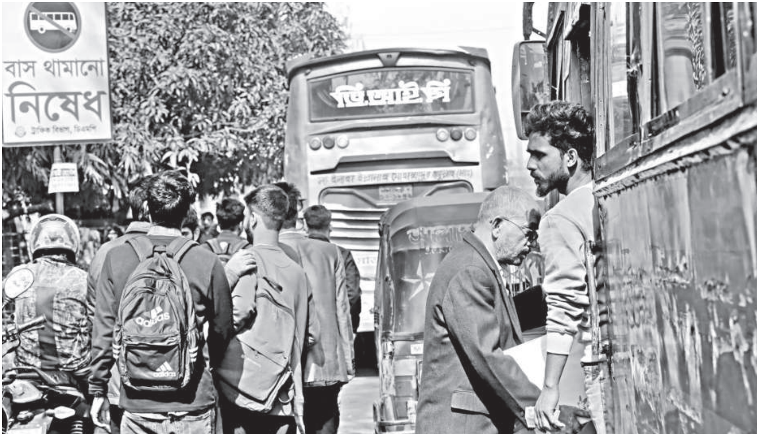
A bus parks to pick up passengers right next to a sign saying "No Bus Parking Here". In Dhaka, irony sometimes knows no bounds and blatant disregard for rules is the norm. The photo was taken opposite Dhaka College yesterday.