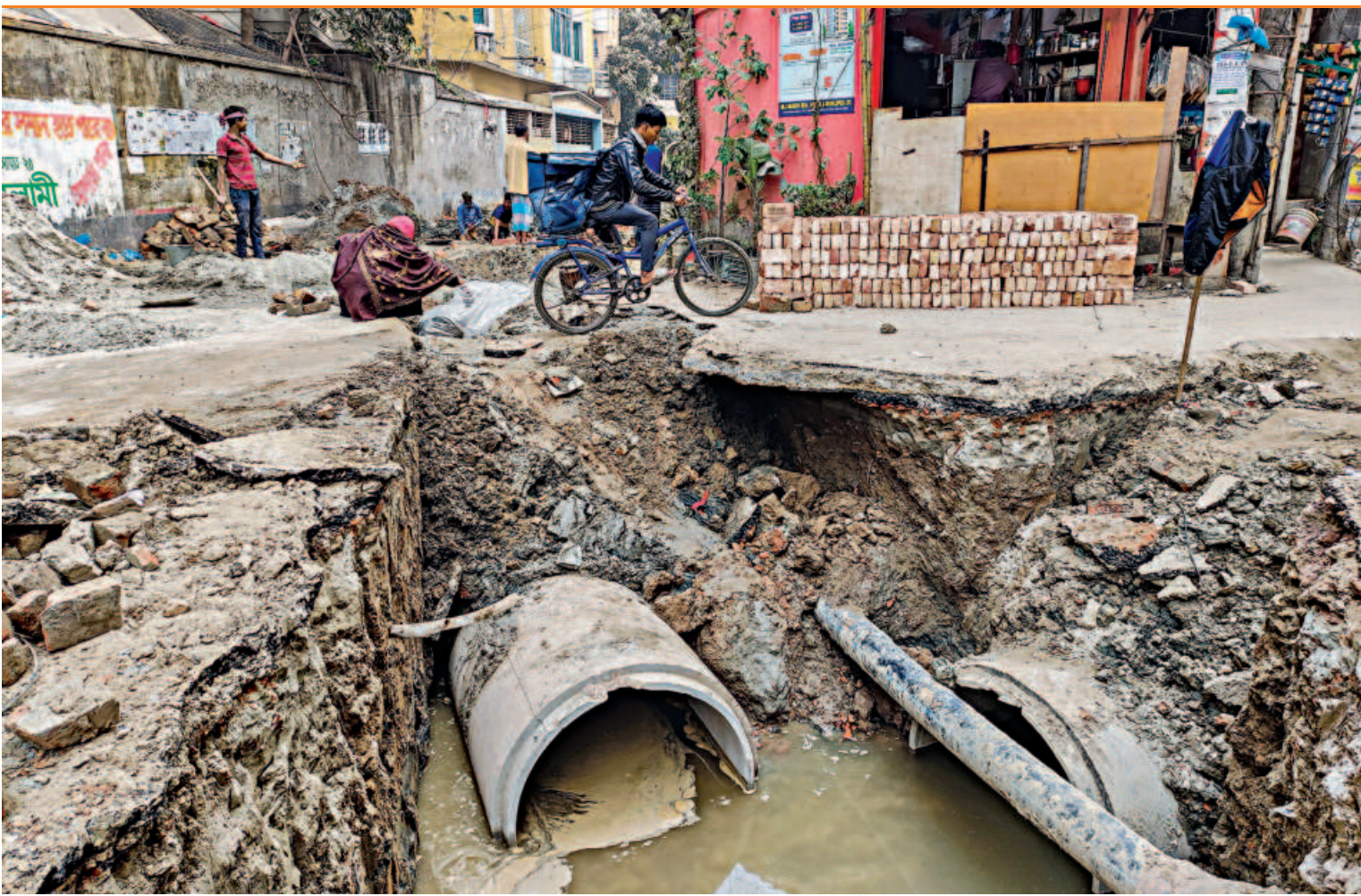
A boy rides a bike through a road dug up for drainage work in the Janata Housing area of Adabor yesterday. Despite the project running for over a week, there are no proper safety measures or barricades in place, putting pedestrians at risk.