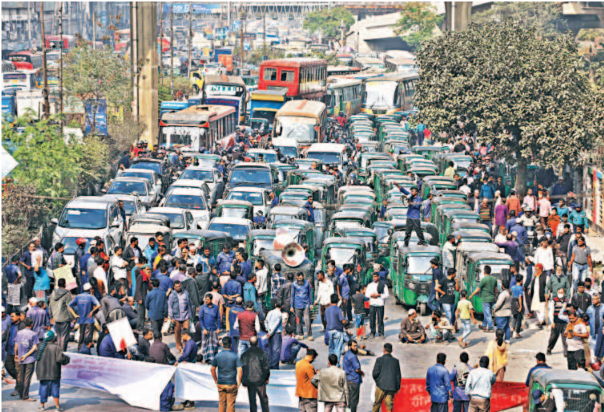
Traffic at key intersections in Dhaka came to a standstill yesterday as protesters with different demands blocked at least four important intersections of the city. The photos were taken in Banani, Shahbagh, and Shaheed Minar areas.