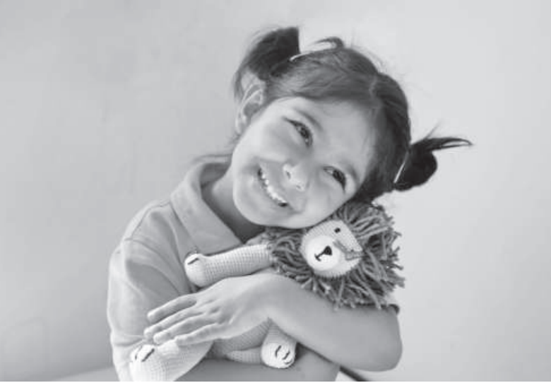
Eco-friendly toys crafted from natural materials by local artisans can be a safer alternative for children.

highlighted the shocking risks associated with toxic metals in children's toys, which have serious implications for physical, cognitive, and neurological development. For instance, lead exposure is known to cause developmental delays and cognitive impairments, while mercury and cadmium threaten kidney function and respiratory