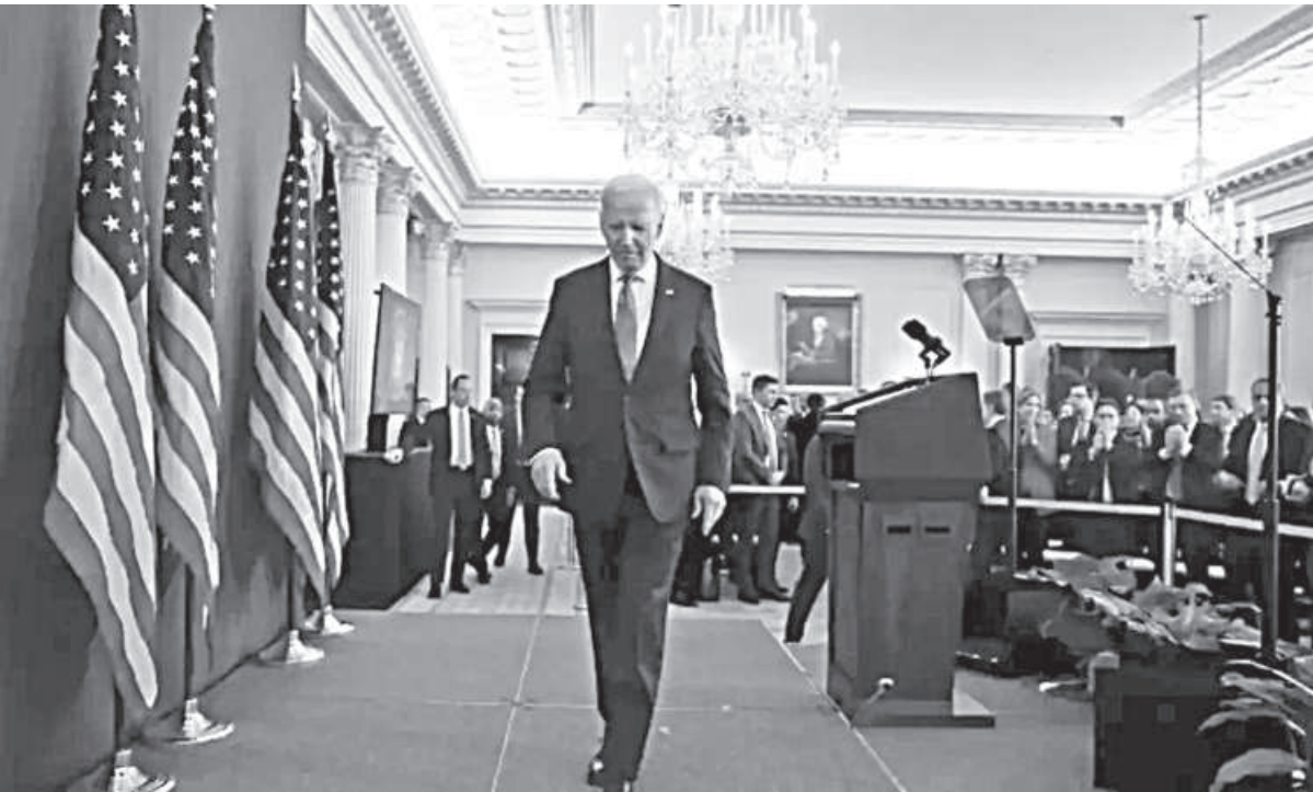
US President Joe Biden leaves the stage after his speech at the State Department in Washington, DC, on January 14, 2025.