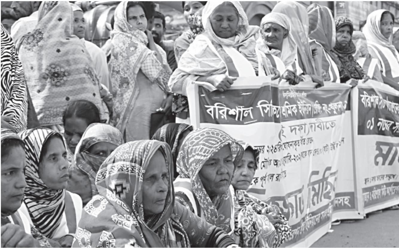
Recently terminated sanitation workers, who worked on a daily wage basis under the sanitation department of Barishal City Corporation, form a human chain in front the Nagar Bhaban yesterday, demanding their reinstatement and adequate compensation.

The Anti-Corruption Commission will send graft information about Saima Wazed Putul, daughter of ousted prime minister Sheikh Hasina, to the foreign ministry today. According to sources at the ACC, the graft watchdog is mulling to send the information to the World Health Organization through the Ministry of Foreign Affairs. Putul serves as the regional director of the WHO. Based on the information sent by the ACC regarding the corruption case, the ministry might write to the WHO to take action against her, said sources. In October last year, the foreign ministry had informed the WHO of its reluctance to work with Putul. Subsequently, the ACC filed a case against Putul, her mother, and other family members, alleging fraud and forgery to obtain a plot in Purbachal. Now, the ministry may request action based on the details of that case provided by the ACC. In November 2023, Putul was elected regional director of the WHO for the South-East Asia Region. She was appointed for a five-year term during the WHO regional conference held in New Delhi, India.