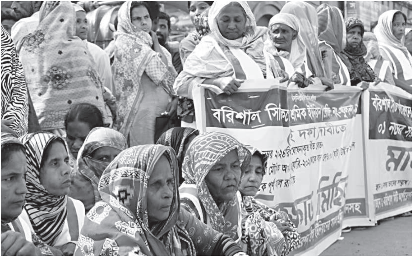
Recently terminated sanitation workers, who worked on a daily wage basis under the sanitation department of Barishal City Corporation, form a human chain in front the Nagar Bhaban yesterday, demanding their reinstatement and adequate compensation.