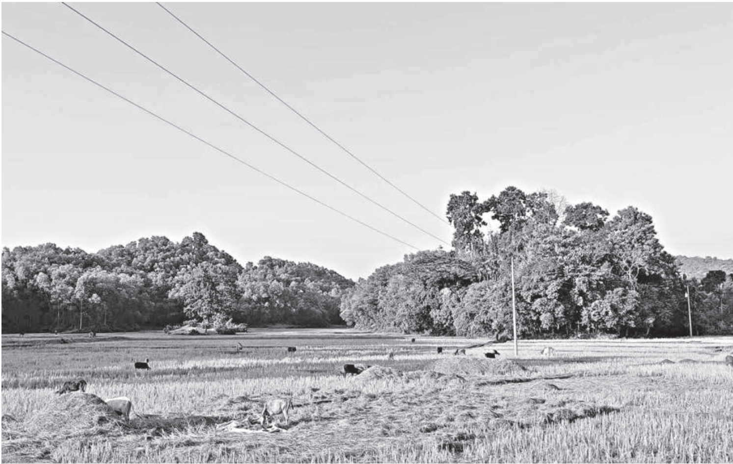
Large sections of forest in areas of Netrakona, adjacent to the Garo Hills of Mymensingh, have been destroyed due to illegal logging and encroachment over the years. The photo was taken at Gopalpur in Durgapur upazila recently.