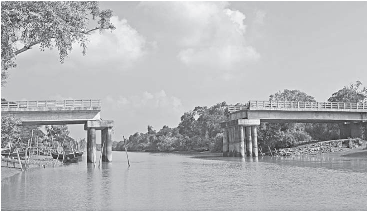
Construction of the only bridge to Tangragiri Eco Park in Taltoli upazila, Barguna, has been stalled for two and a half years due to design complications. The Local Government Engineering Department began constructing the bridge over Fakirhat canal at a cost of Tk 7 crore in early 2021. Tourists are suffering due to the delay. The photo was taken recently.