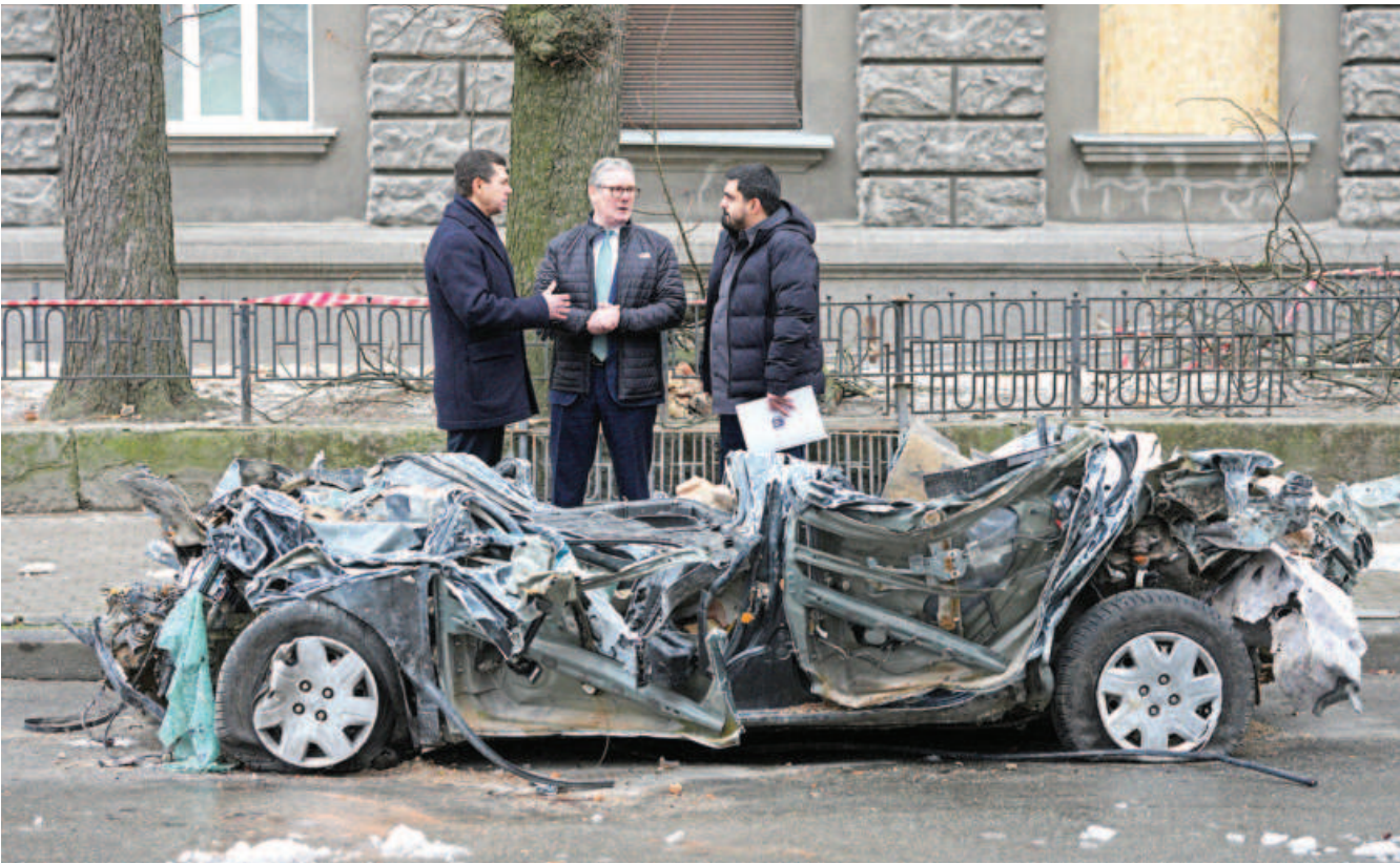
Britain's Prime Minister Keir Starmer stands with Ukrainian officials as he examines the wreckage of a vehicle along a street in Kyiv yesterday. Starmer and Ukrainian President Volodymyr Zelensky signed a landmark 100-year partnership agreement to deepen security ties and strengthen their countries' relationship.