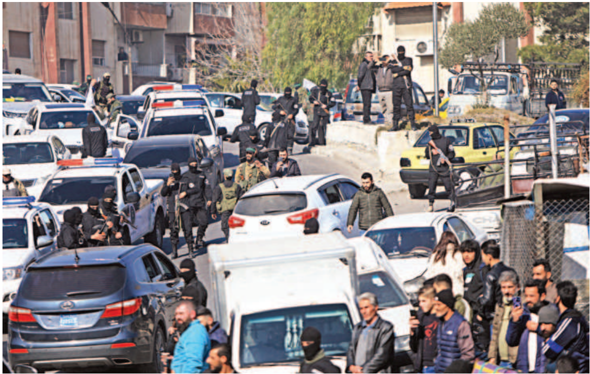
Security forces reporting to Syria's transitional government launch a search operation in Dummar, a suburb of the Syrian capital Damascus, during their campaign to seize weapons and hunt down armed supporters of the ousted Assad leadership yesterday.

unchanged: our energy infrastructure," Zelensky said in a social media post on X platform. "Among their objectives were gas and energy facilities that sustain normal life for our people." The capital Kyiv also came under attack, with hundreds of residents taking shelter in underground metro stations across the capital, sleeping on yoga mats and sitting on folded chairs with their pets. The governor of Ukraine's western Lviv region said two energy facilities, in the Drohobych and Stryi districts, were damaged. In neighbouring Ivano-Frankivsk, the governor said air defences were fending off Russian attacks on facilities. Both said no injuries had been reported. Ukrainians use natural gas mainly for heating homes and cooking. The country uses gas stored over the summer months to use in winter, when daily production does not cover consumption.