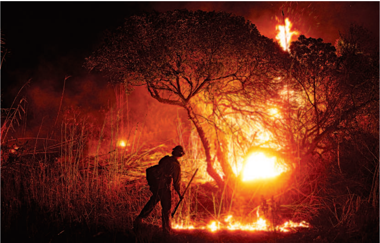
A firefighter monitors the spread of the Auto Fire in Oxnard, northwest of Los Angeles, California, US on Monday night. Hot, powerful winds yesterday threatened to rekindle and whip up major fires that have devastated the hills and suburbs of Los Angeles, killing at last 24 people and changing the face of America's second biggest city forever.

Soon after the report's overnight release, Trump hit back on his Truth Social platform, calling Smith "deranged".