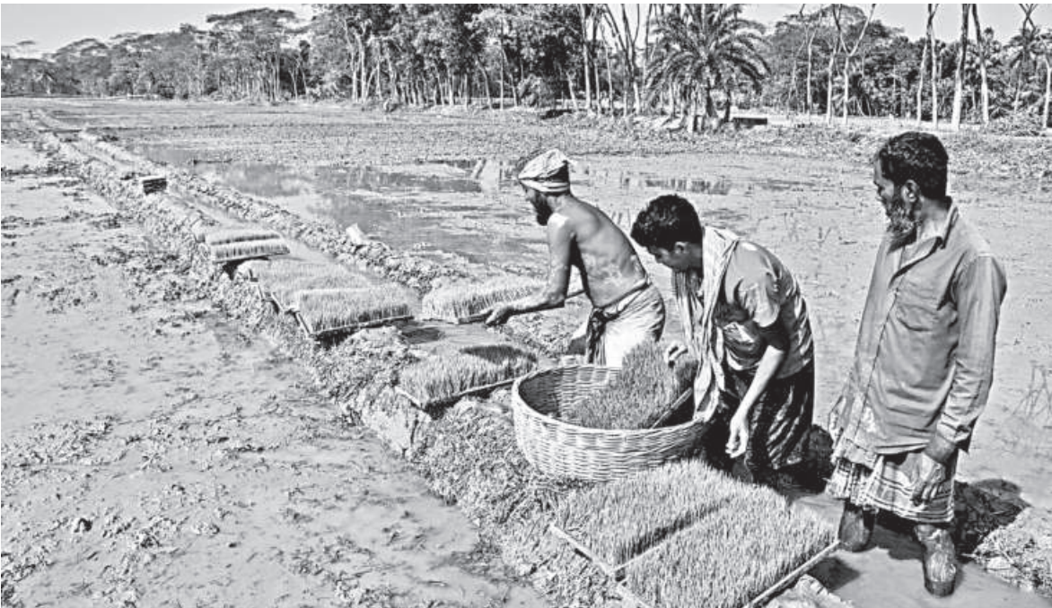
Farmers use a paddy plant transfer machine to plant Boro seedlings at Batna village, Barishal. The photo was taken recently.