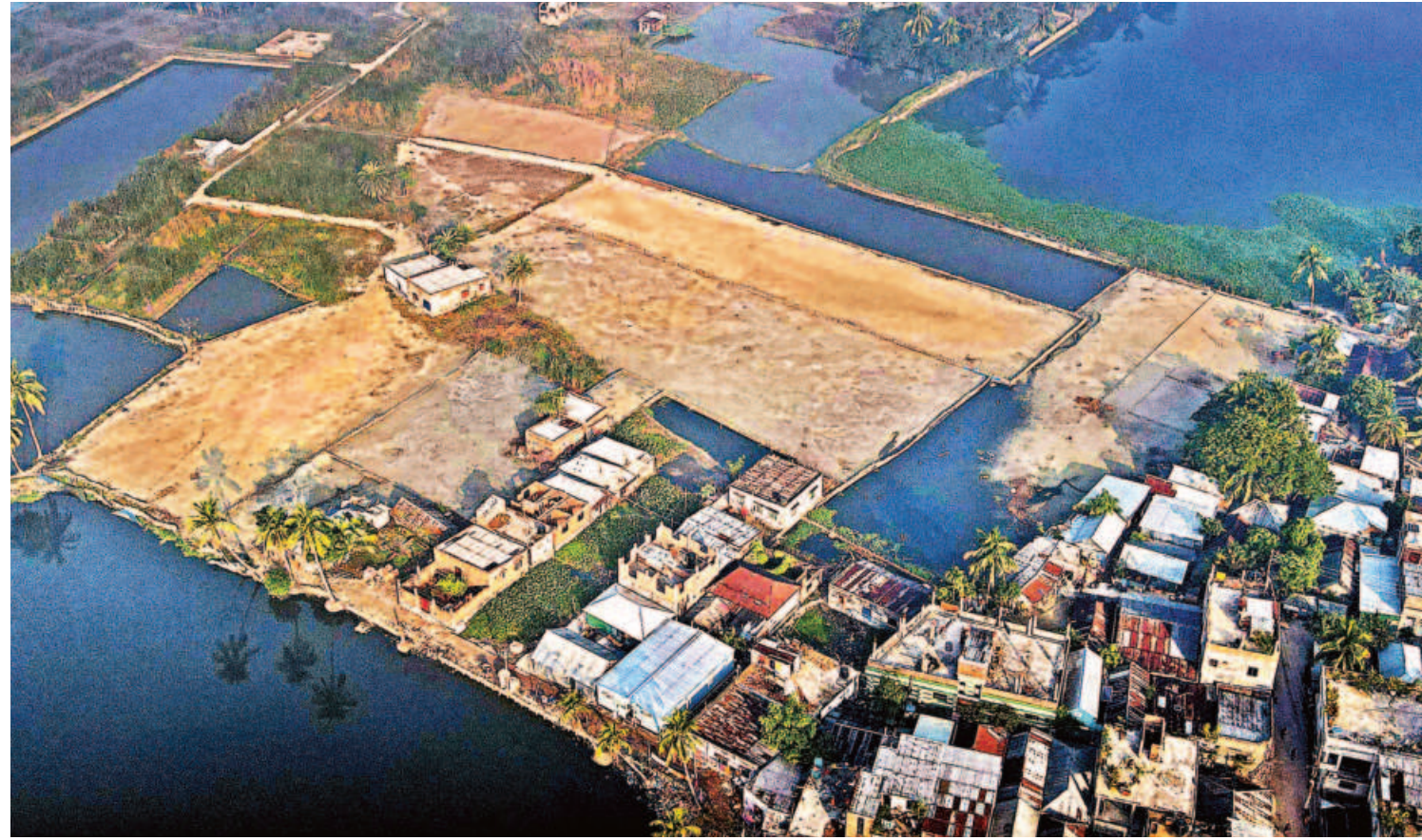
A large swathe of wetland in Khulna city's Khalishpur has been filled with sand to make way for a housing project. This has not only hampered the biodiversity but also increased the chances of flooding in the area. Such unplanned housing projects are largely behind the shrinking of agriculture lands and wetlands. The photo was taken recently.

According to sources in the Constitution Reform Commission, its proposals may include a two-term limit for prime ministers to curb the head of government's absolute power. It may also recommend establishing a balance of