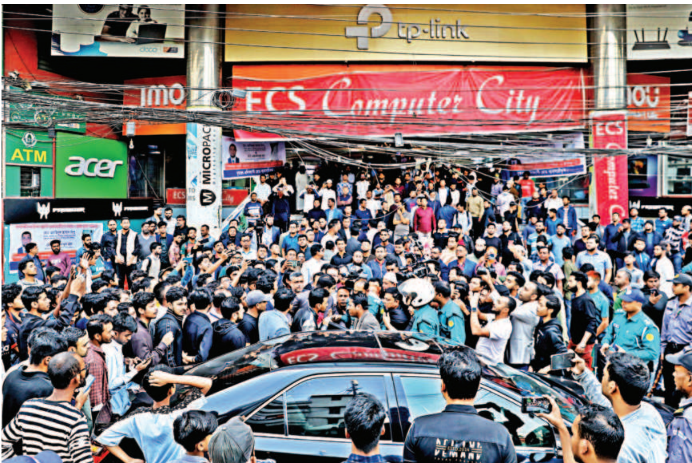
Protesting Friday night's attack on two fellow traders by armed criminals, shop owners and employees demonstrated in front of the Multiplan Centre in the capital's Elephant Road around noon yesterday. Adviser Asif Mahmud is seen arriving at the scene. He assured them of security and justice following which the trades withdrew. Story on page 1.