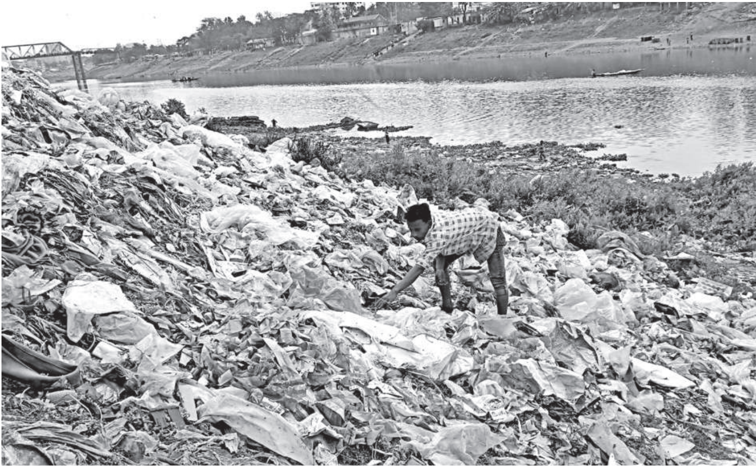
In the Kazirbazar area of Sylhet city, the Surma river is facing severe pollution due to the dumping of waste and garbage. Local businesses and households are contributing to this problem by discarding their waste into the river. As a result, the river's water quality has deteriorated significantly, with plastic and polythene waste causing artificial shoals to form and disrupting the natural flow of the Surma. The photo was taken yesterday.

A bus driver of Ilish Paribahan said, "What is our fault? Hundreds of passengers and transport operators are trapped here for hours..." Earlier on Friday, Tariqul Islam, a joint convener of the Munshiganj Sreenagar upazila Jubo Dal committee, was arrested in connection with a violence case from the Deulbhog area under the same upazila. Around four hours later, some 200 Jubo Dal and Chhatra Dal activists stormed the police station and snatched him away, said Sreenagar Police Station OC Quaiyum Uddin Chowdhury. Yesterday, police filed a case against 31 named individuals and 160-170 unnamed others in connection with the incident, said Anisur Rahman, additional superintendent of police in Munshiganj. "While taking the accused away, they punched and injured policemen. Police are conducting raids in different areas to arrest Tariqul and other accused," he said. Meanwhile, Tariqul has been expelled from Jubo Dal.