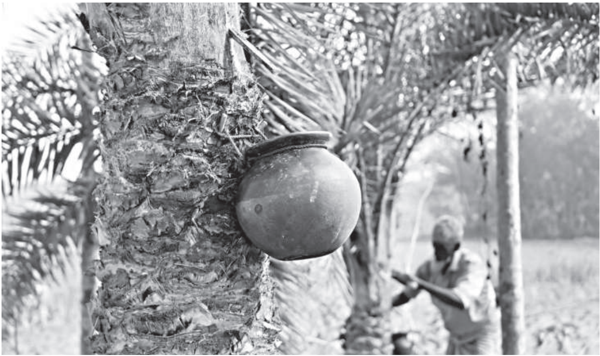
Belayet Hossain, 65, cleans and then trims a date palm tree to collect the juice in a jar that he attaches to the tree. After working for 8-10 hours, Belayet is able to collect around 3.5 litres of juice, which he sells for Tk 250 in the local market. The photo was taken from the Dogolchira village in Jhalakathi recently.