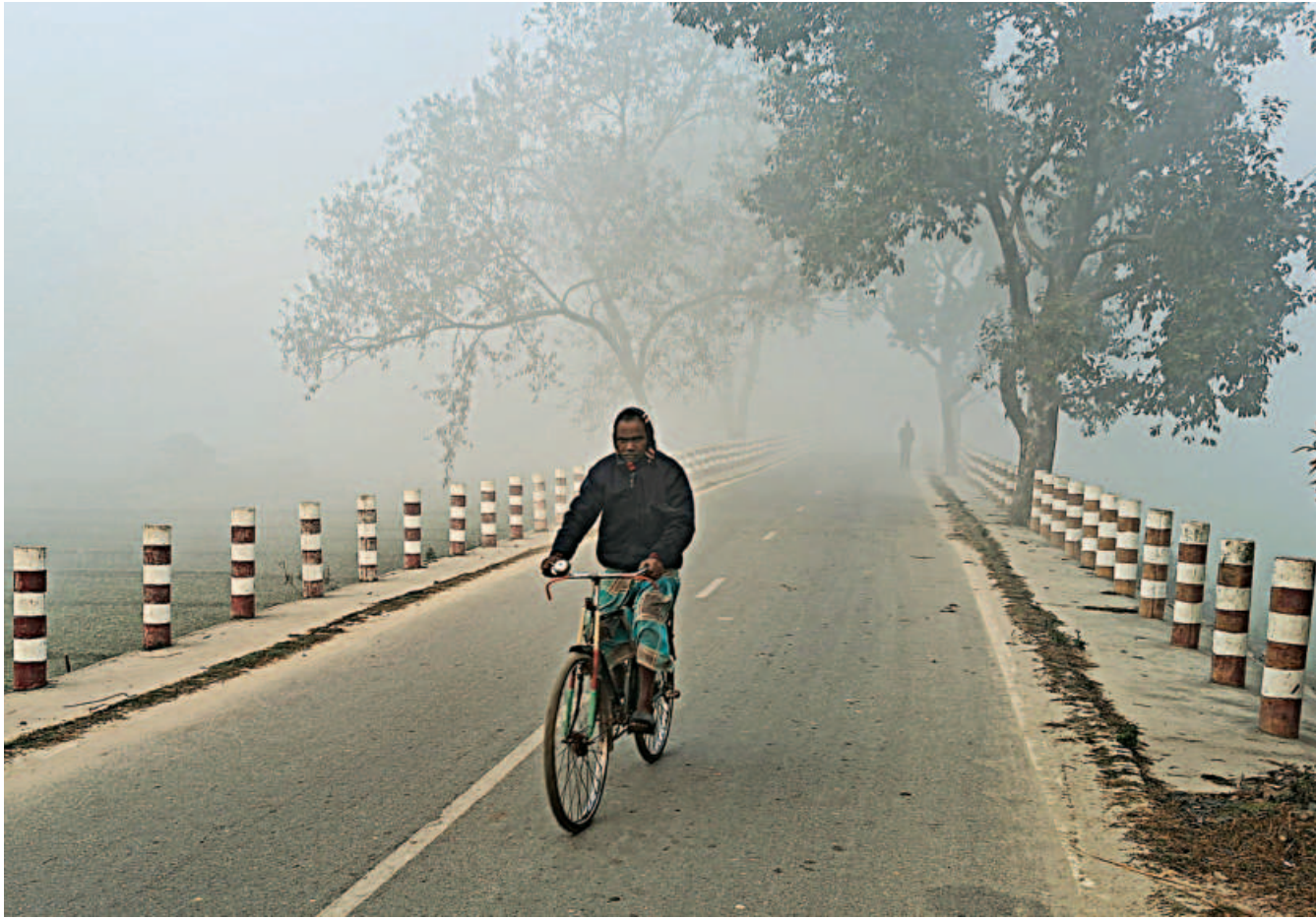
A man on a bicycle pedals through the dense morning fog in Barunagaon village in Thakurgaon yesterday. The icy winds from the Himalayas, coupled with clear skies, have intensified the cold in the northern districts.