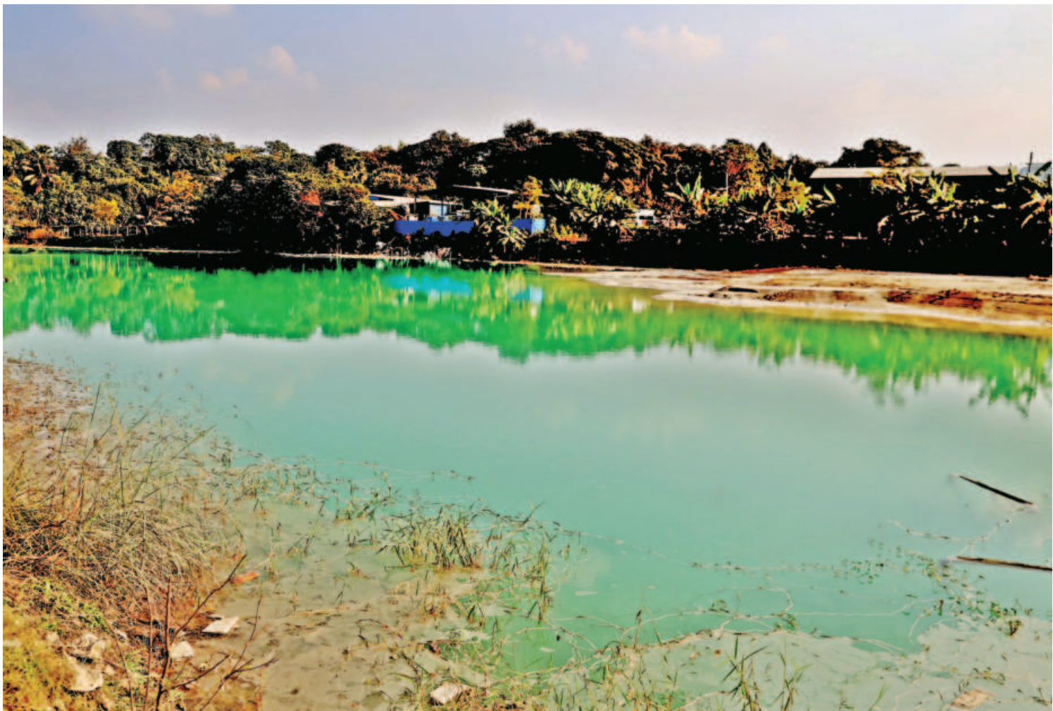
The water of this ditch near the Botanical Garden in Mirpur's Goran Chat Bari area has turned blue due to toxic chemical waste from different factories. The photo was taken yesterday.