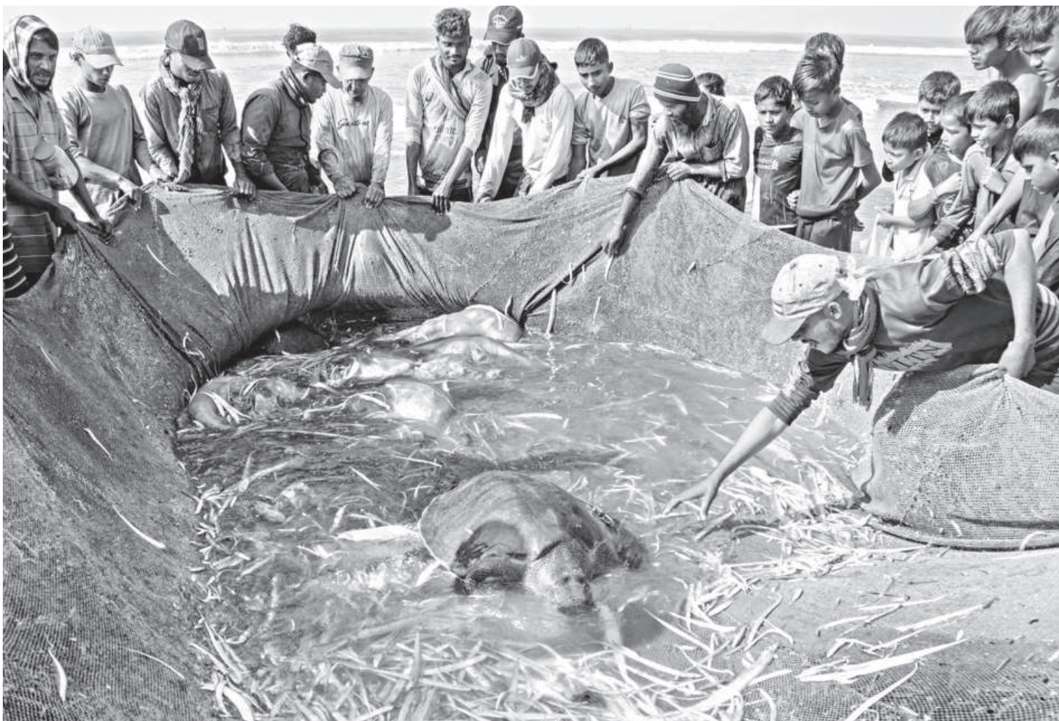
Fishermen along the Cox's Bazar seashore use large nets to catch fish, but these nets often trap other marine creatures such as jellyfish, pufferfish, and turtles. While turtles are usually able to survive, many other aquatic animals are left stranded instead of being returned to the sea, posing a threat to marine biodiversity. The photo was taken at Shamnapur Ghat recently.

All leaders and activists of the BNP and its affiliate and associate organisations were urged to strictly adhere to this directive.