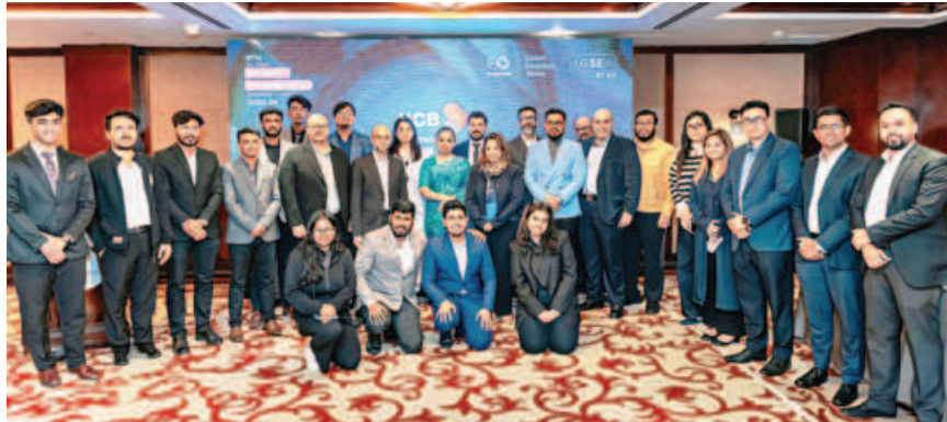
Winners of the semifinal round of the "9th Global Student Entrepreneurs Awards" (GSEA) Bangladesh chapter pose for group photographs with other participants, judges, organisers of the competition and high officials of United Commercial Bank at Six Seasons Hotel in the capital recently.