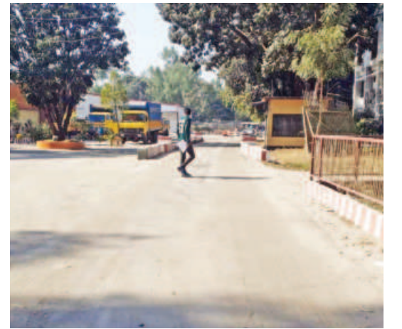
No imports were recorded through the port in the past three days.

The protests have left Banglabandha's usually busy yard nearly empty, causing port activities to grind to a halt.