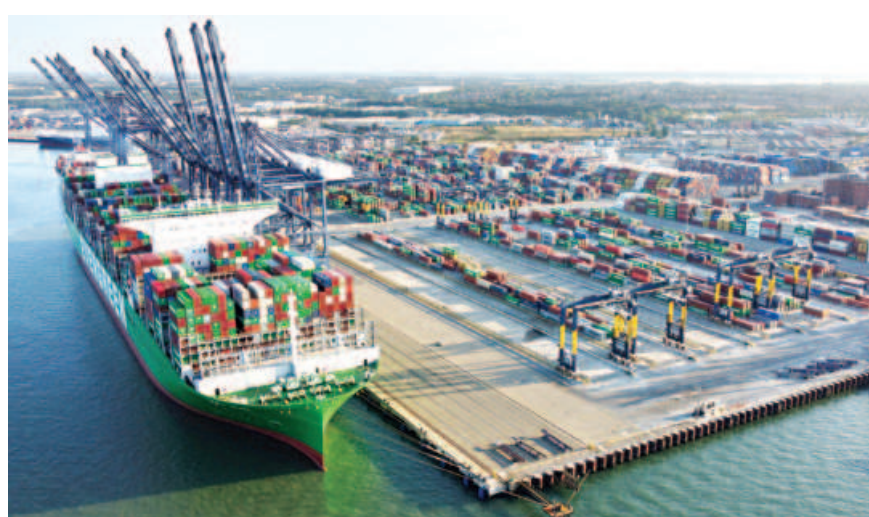
A container ship is docked next to cranes in Felixstowe, Britain. The global economy and financial system has shown a surprising resilience in the face of even severe shocks.

Trump exemplifies that uncertainty. The returning president's agenda for his second term in office is a jumble of slogans and often contradictory ideas. Watching his administration convert these into policies will be a source of deep anxiety around the world. Will the man who inspired "Trump: The Art of the Deal" impose blanket tariffs on US imports, or use the threat of them as a negotiating tool? Will he actively abandon military alliances, or push US allies to buy more American armaments? Will he undermine the rule of law, or will the US Constitution restrain him? READ MORE ON B2