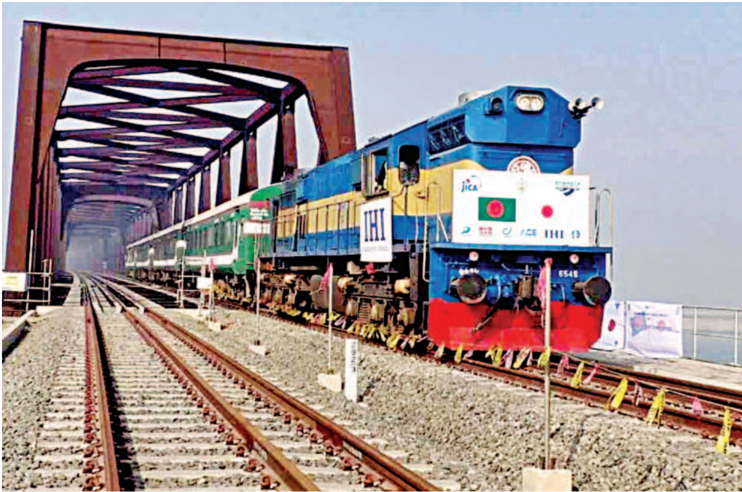
Bangladesh Railway yesterday conducted a trial run with trains running at full speed -- 120km per hour -- on the Jamuna Railway Bridge from the east end (Bhuapur, Tangail) to the west end (Sirajganj Sadar upazila). The authorities said the bridge would be inaugurated soon if everything goes well with the trial.