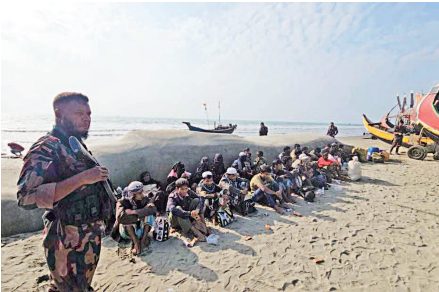
A BGB official stands guard next to 36 Rohingyas, who were detained after illegally entering Bangladesh through the Bay of Bengal yesterday afternoon.