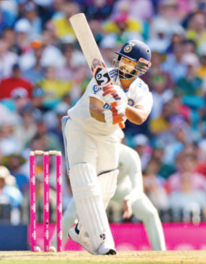
Rishabh Pant plays a shot on way to a blistering knock, reaching fifty off just 29 deliveries on Day 2 of their fifth and final Test against Australia at the Sydney Cricket Ground yesterday. Pant smashed six boundaries and four maximums during an exhilarating 33-ball 61-run knock.