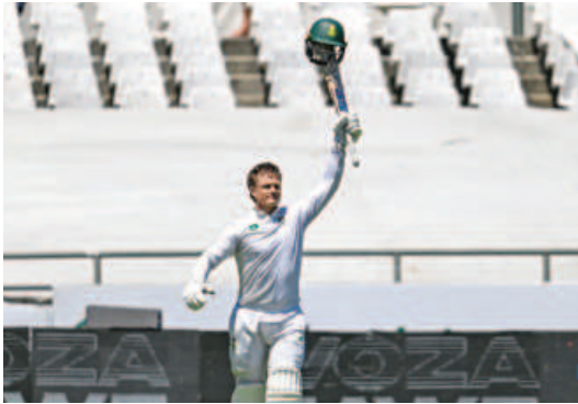
Ryan Rickelton became only the third South African batter to smash a Test double ton at home on Saturday, scoring 259 off 343 deliveries to help the Proteas pile up 615 first-innings score on Day 2 of their second Test against Pakistan in Cape Town. The two other South Africans to score 250-plus scores at home were Gary Kirsten (275 vs England in Durban in 1999) and Graeme Pollock (274 vs Australia in Durban 1970).

But Slot has batted away any question thrown at him without batting an eyelid while Salah, who has 17 goals and 13 assists this season, continues to set new milestones as he looks ahead to playing his favourite opponent.