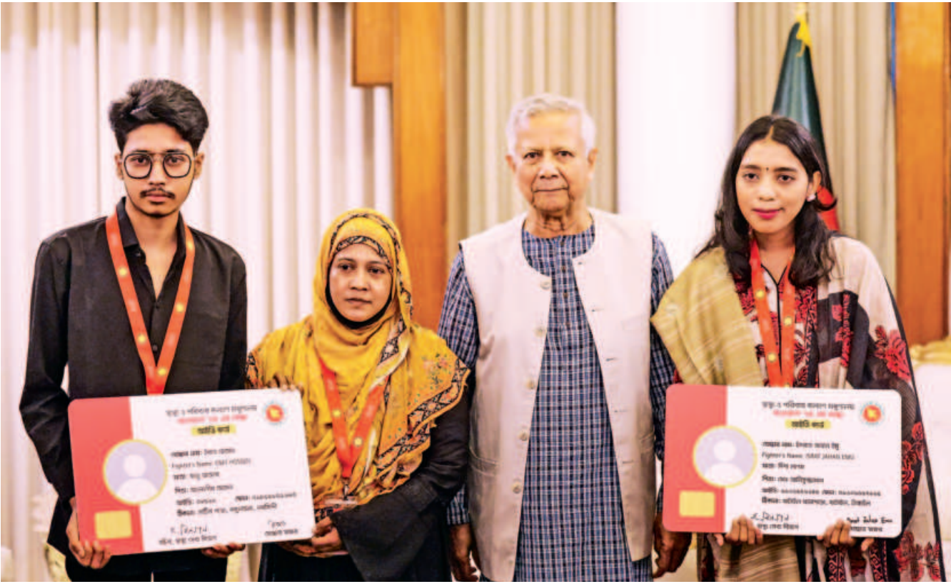
Chief Adviser Professor Muhammad Yunus inaugurated the health card distribution programme of the Ministry of Health to ensure free health treatment to the victims of the July uprising in the country's all public hospitals. The chief adviser launched the programme at the State Guest House Jamuna yesterday evening. At the event, Prof Yunus handed over health cards to two students, who were injured in the uprising.