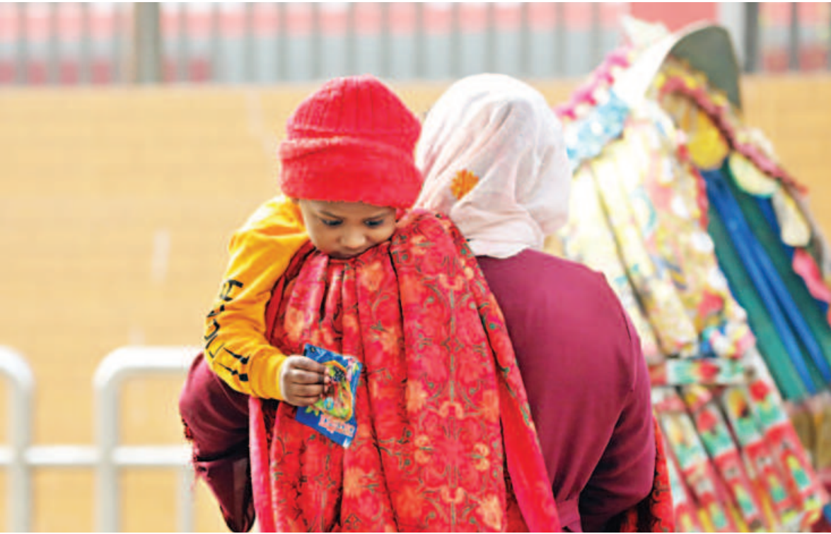
Nothing beats the warmth of a mother's embrace on a chilly Dhaka morning! Wrapped up snug and cozy, a child heads out with his mother to take on the day together. The photo was taken in Mohammadpur Bus Stand area yesterday.