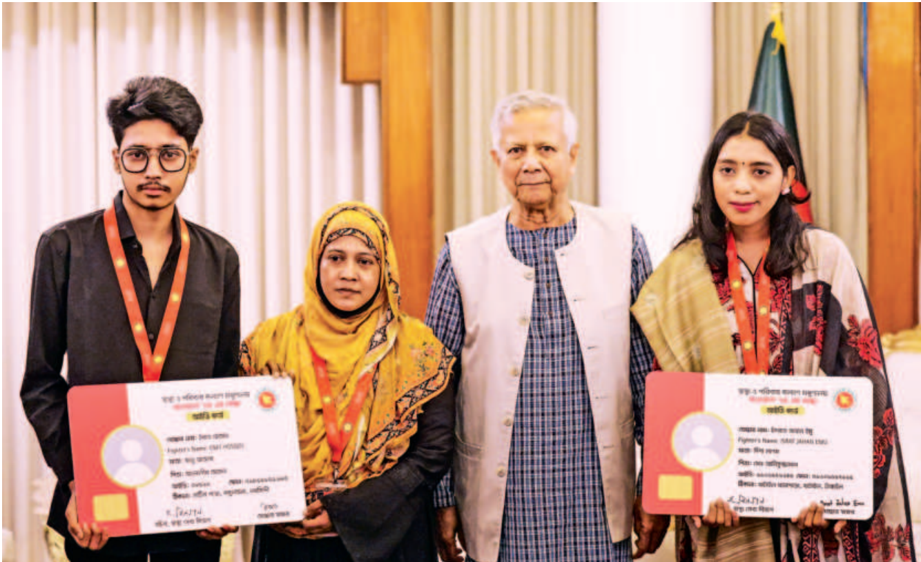
Chief Adviser Professor Muhammad Yunus inaugurated the health card distribution programme of the Ministry of Health to ensure free health treatment to the victims of the July uprising in the country's all public hospitals. The chief adviser launched the programme at the State Guest House Jamuna yesterday evening. At the event, Prof Yunus handed over health cards to two students, who were injured in the uprising.

Chief Adviser Prof Muhammad Yunus yesterday said the ensuring financial security of the families of the martyrs and the injured in the students-people’s uprising is the state’s responsibility. “It is the responsibility of the state to ensure medical care for the wounded fighters. We will do that. The government will ensure their financial security,” he said while inaugurating the distribution of health cards for them at the State Guest House Jamuna. Yunus said having this health card means that cardholders will get treatment at any government hospital in the country at any time, be it after a year or two. “This card will always be there.” He said they also have to think about the mental and social rehabilitation of the fighters injured in July. According to the Ministry of Health, health cards will be distributed to specific districts every week among those injured in the July uprising.