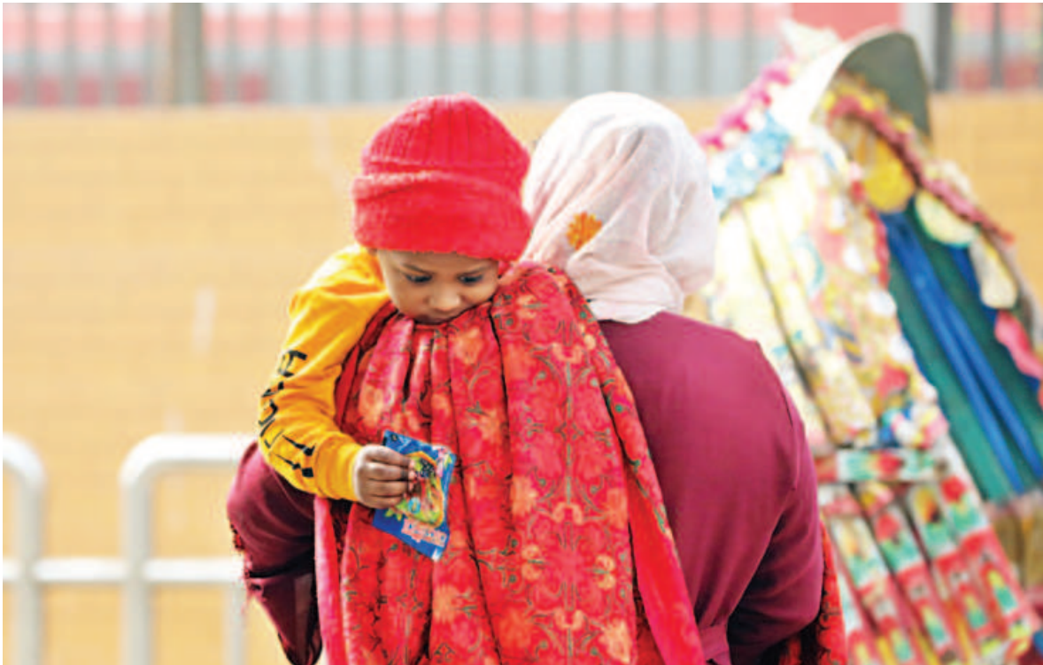
Nothing beats the warmth of a mother’s embrace on a chilly Dhaka morning! Wrapped up snug and cozy, a child heads out with his mother to take on the day together. The photo was taken in Mohammadpur Bus Stand area yesterday.