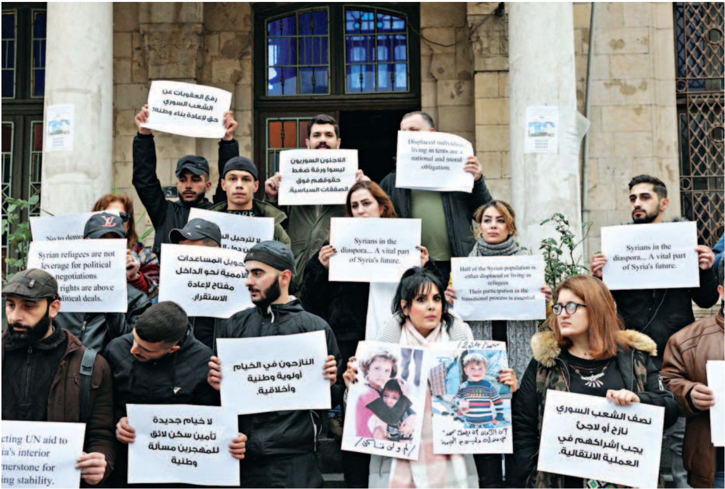
Activists and journalists from the civil society take part in a solidarity stand to demand the participation of displaced Syrians and refugees in the political process and national dialogue in Damascus, Syria, yesterday, after president Bashar al-Assad was ousted.