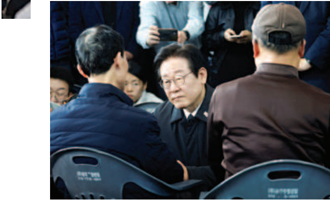
A Jeju Air official bows his head and apologises to the bereaved families of passengers of the Jeju Air flight that crashed and burst into flames at Muan International Airport in Muan, South Korea yesterday. Inset, South Korea's opposition Democratic Party leader Lee Jae-myung meets family members of the victims. South Korea's acting President Choi Sang-mok has ordered an emergency safety inspection of the country's entire airline operation.

Says ADR report INDIA TODAY ONLINE India's Andhra Pradesh Chief Minister N Chandrababu Naidu is the richest chief minister in India with assets worth over Rs 931 crore, while West Bengal's Mamata Banerjee is the poorest with just Rs 15 lakh, according to an Association for Democratic Reforms (ADR) report released yesterday. The report said the average asset per chief minister (CM) from state assemblies and union territories is Rs 52.59 crore. Jammu and Kashmir Chief Minister Omar Abdullah, with assets worth Rs 55 lakh, is the second poorest in the list and Pinarayi Vijayan is third with Rs 118 crore. While India's per capita net national income was approximately Rs 1,85,854 for 2023-2024, the average self-income of a chief minister is Rs 13,64,310, around 7.3 times the average per capita income of India.