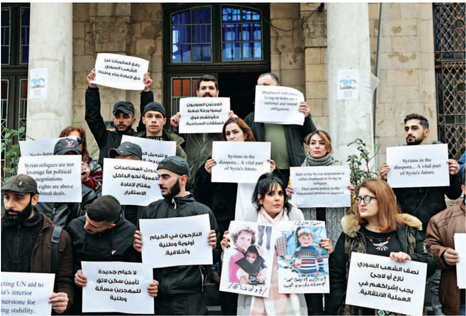
Activists and journalists from the civil society take part in a solidarity stand to demand the participation of displaced Syrians and refugees in the political process and national dialogue in Damascus, Syria, yesterday, after president Bashar al-Assad was ousted.