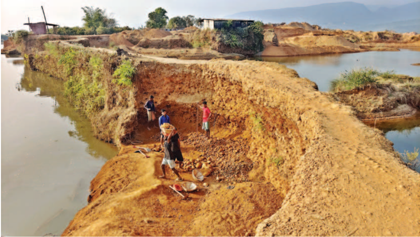
What once was a lush green hill in Companiganj upazila of Sylhet is now a barren land with water-filled craters, due to illegal stone extraction. Locals say the extraction goes on every day, with authorities turning a blind eye.