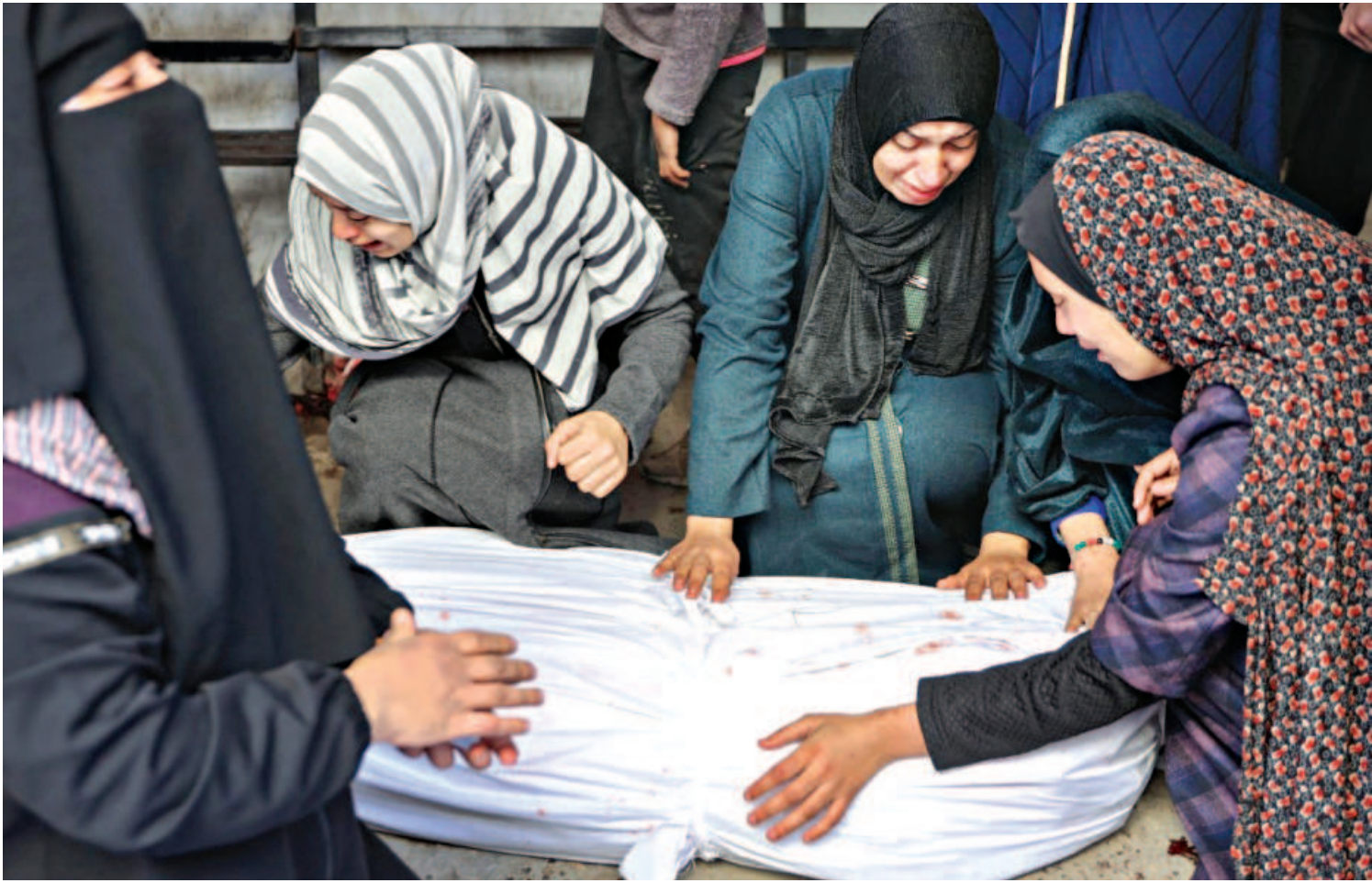
Women mourn over a body at a hospital in Gaza City yesterday. Palestinian sources said that Israeli strikes in Gaza killed at least 45 people on Thursday.