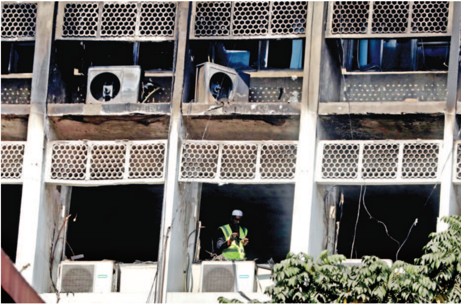
A forensic team member examines the aftermath of a devastating fire that broke out at Building No-7 of the Secretariat in Dhaka early Thursday. The photo was taken yesterday.

STAFF CORRESPONDENT Bureaucrats whose Secretariat offices have been gutted in a fire will work at the office rooms of relevant departments for the time being. The government yesterday also decided that journalists with accreditation cards and general people with temporary passes will not be allowed entry to the Secretariat complex due to "security concerns". The committee formed by the Cabinet Division to investigate the fire started its work yesterday. A secretary to one of the fire-affected ministries said he sent a representative to assess the situation yesterday. The representative reported to him that the affected building is currently without electricity and water supply. The secretary, who requested anonymity, said they were planning to have staff from the affected ministries and divisions continue their work in other departments under his ministry. Some officials of these ministries already started using rooms of his department on Thursday, hours after the fire ravaged parts of the heart of the administration. "We are also considering whether we can use some rooms from other ministries in the Secretariat," the secretary told The Daily Star. He said despite the fire, they will easily be able to SEE PAGE 6 COL 1