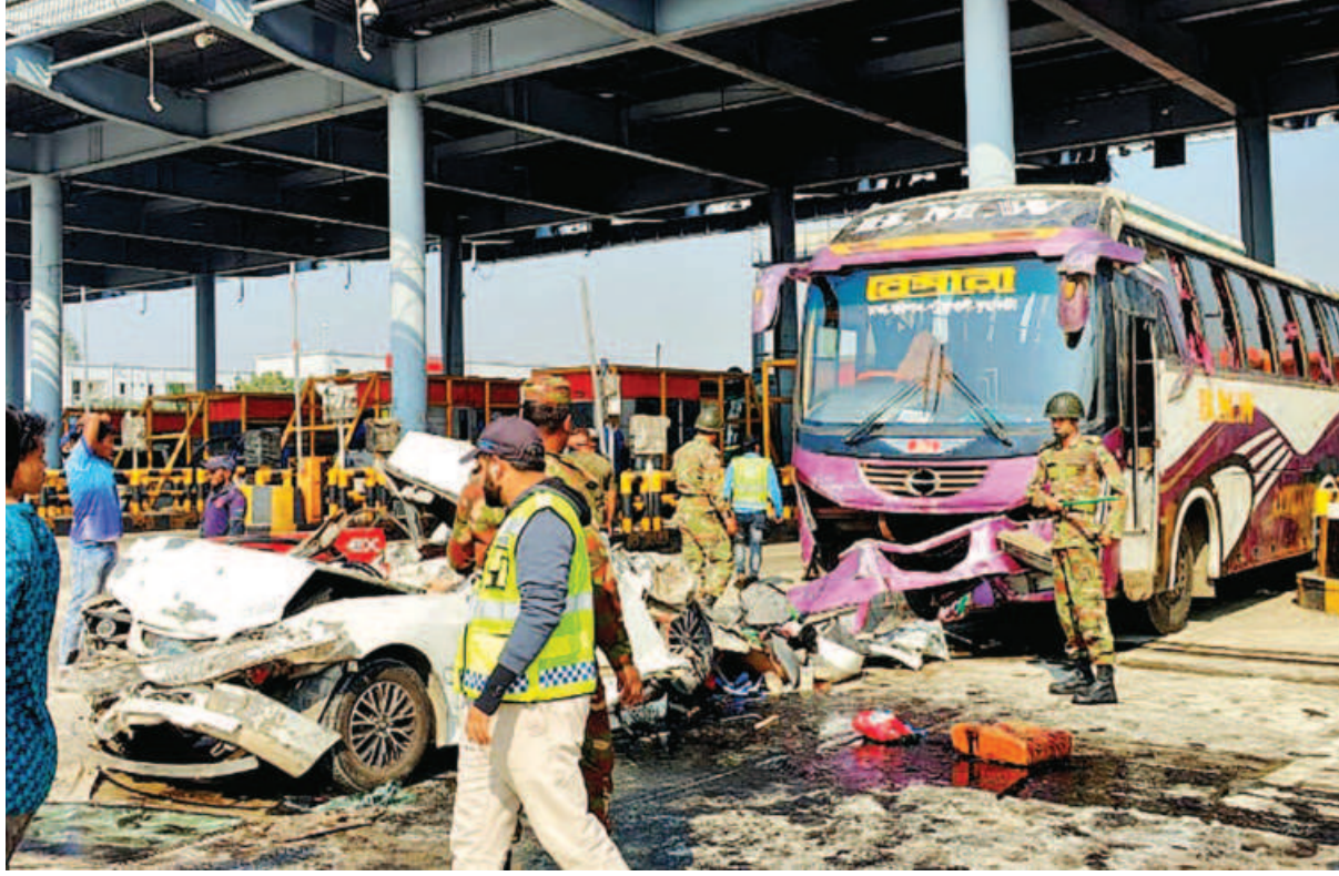
The mangled remains of a car at the Dhaleshwari toll plaza on the Dhaka-Mawa Expressway in Keraniganj, Dhaka. The accident occurred yesterday morning when a Bepari Paribahan bus rammed into the stationary car, a microbus and a motorcycle from behind at the toll plaza, resulting in six fatalities.