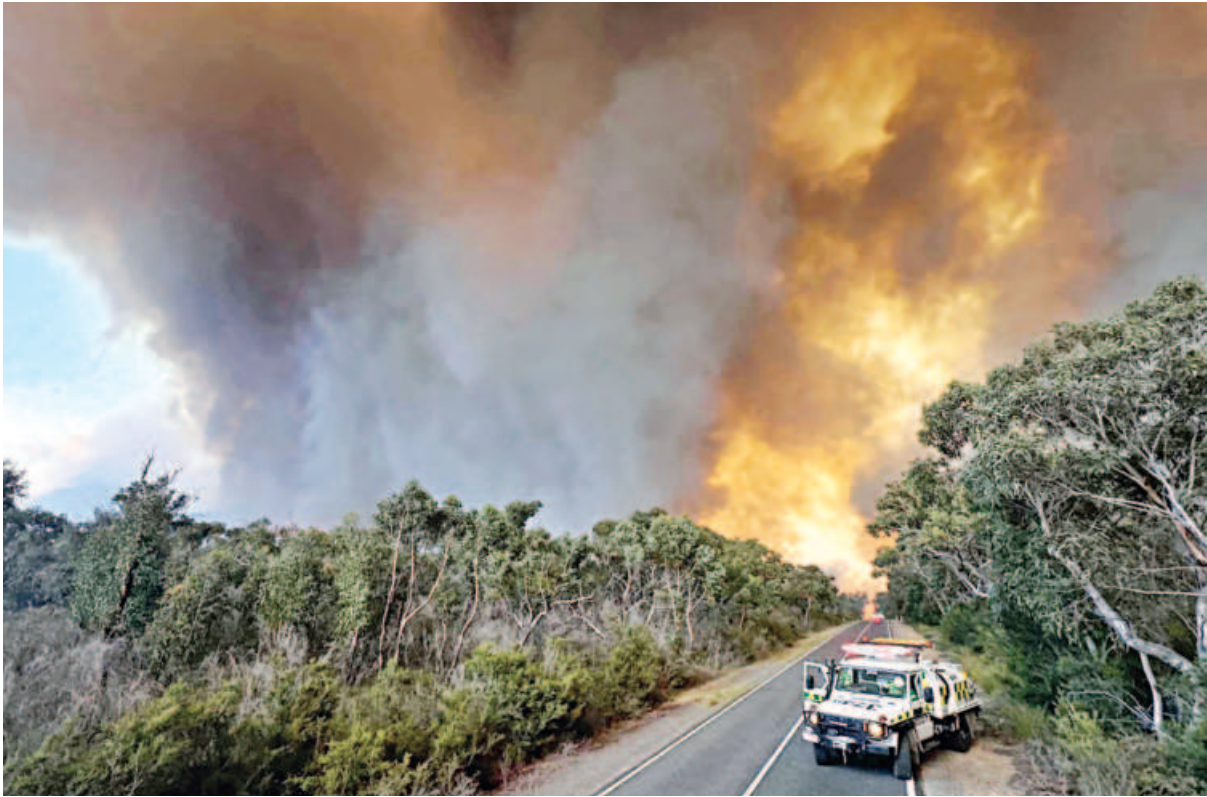
This handout image, received yesterday from the State Control Centre of the Victoria Emergency Services, shows officials on a road near a bushfire in the Grampians National Park in Victoria, Australia.

The Republican's comeback electoral win in November came on the back of heightened political polarization and division across the country, which Trump leaned into in his posts.