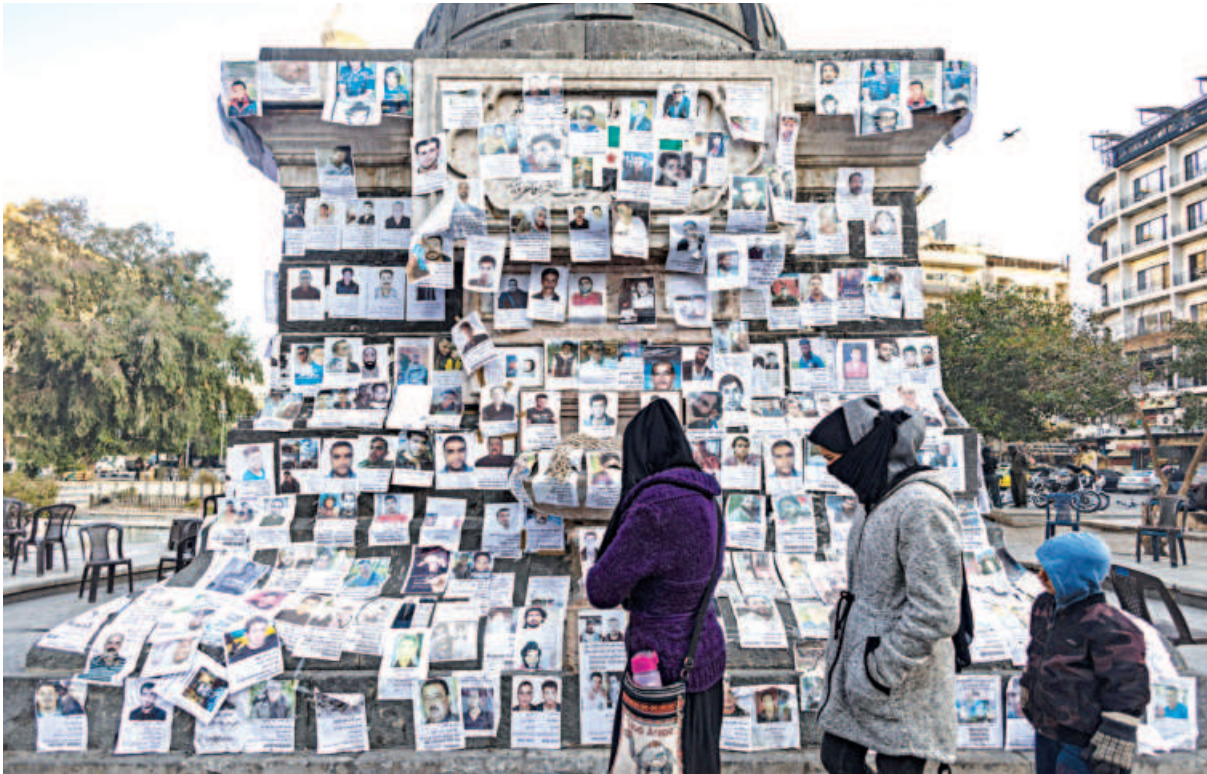
Posters of missing people hang on a monument in the centre of Marjeh Square in Damascus, Syria yesterday. Some 157,000 people disappeared into Syria's prisons and other government facilities according to the Syrian Observatory for Human Rights.