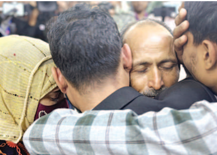
The three siblings hug their father tight at Dhaka airport yesterday as they got reunited with him after 18 long years.