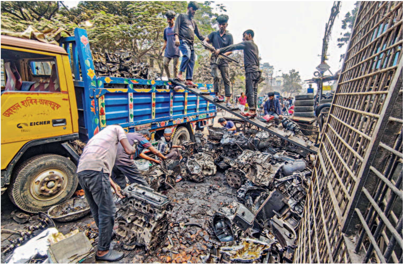
Workers dismantling parts of old and abandoned vehicles to separate metals for recycling. The entire process takes place near a workshop, occupying the footpath and road. This photo of a truck being loaded with the materials was taken at Dholaipar recently.