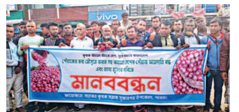
Farmers form a human chain on the Pabna-Sujanagar road.