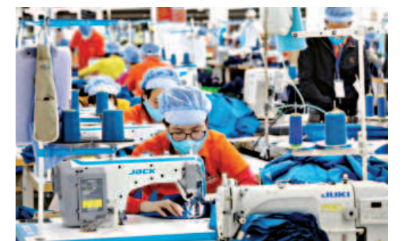
Workers are seen at a garment factory in Hung Yen province of Vietnam.

Meanwhile, Bangladesh set a target of $40.48 billion for garments, out of a total of $50 billion for overall exports, with an 11.99 percent growth for fiscal year 2024-25. Bangladesh does not set garment export targets on the basis of calendar year.