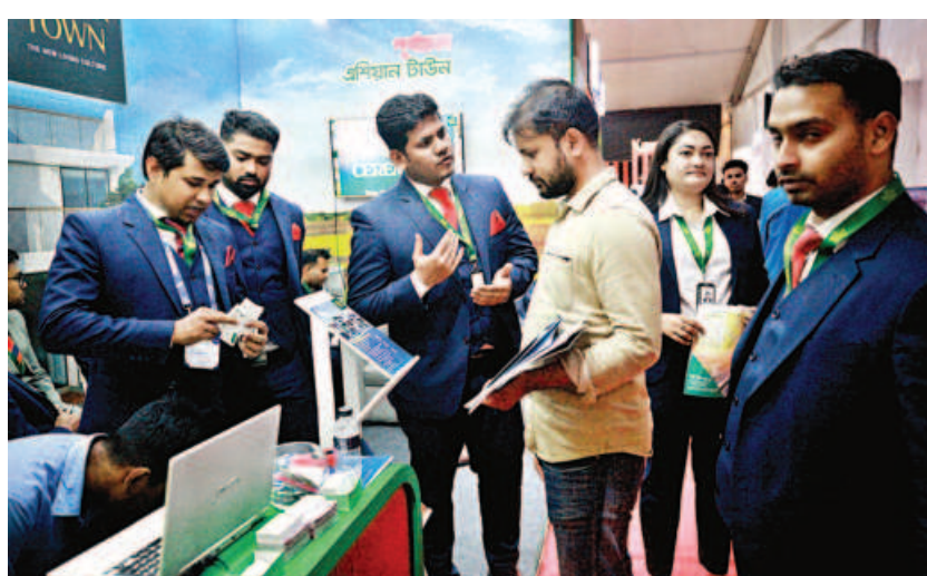
A stall attendant of a real estate developer briefs a visitor at REHAB Fair-2024 at Bangabandhu International Conference Centre in Dhaka yesterday.

there would be a low number of potential buyers prior to participating in the fair.