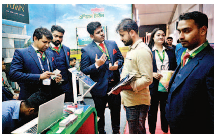
A stall attendant of a real estate developer briefs a visitor at REHAB Fair-2024 at Bangabandhu International Conference Centre in Dhaka yesterday.

there would be a low number of potential buyers prior to participating in the fair.