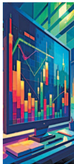
Market turnover (In crore taka)

Orion Infusion Ltd emerged as the most traded share, with a turnover