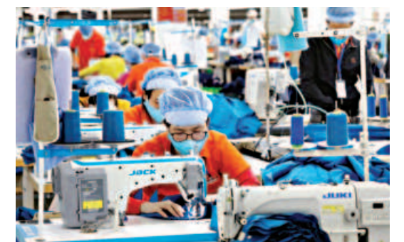
Workers are seen at a garment factory in Hung Yen province of Vietnam.

Meanwhile, Bangladesh set a target of $40.48 billion for garments, out of a total of $50 billion for overall exports, with an 11.99 percent growth for fiscal year 2024-25. Bangladesh does not set garment export targets on the basis of calendar year.