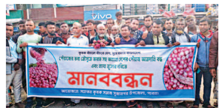
Farmers form a human chain on the Pabna-Sujanagar road.