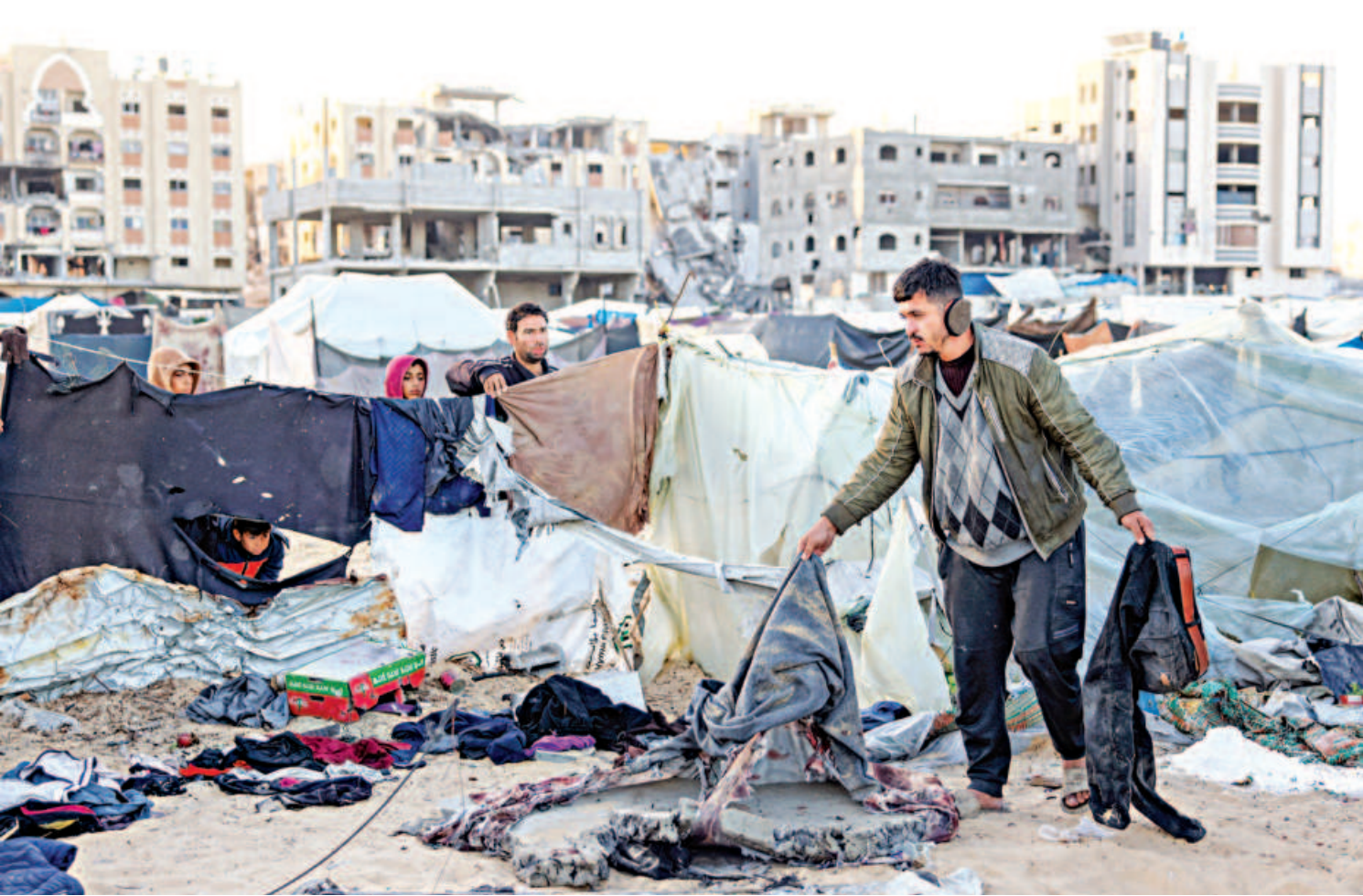
Palestinians inspect the site of Israeli bombardment on tents sheltering displaced people from Beit Lahia at a camp in Khan Yunis in the southern Gaza Strip yesterday. The health ministry in Gaza said that 23 people had been killed in the Palestinian territory, taking the overall death toll to 45,361.

REUTERS, Dubai Hamas yesterday accused Israel of imposing “new conditions” that it said were delaying a ceasefire agreement in the war in Gaza, though it acknowledged negotiations were still ongoing. Israel refuted the allegation, saying it was Hamas that was creating “new obstacles” to a deal. Indirect talks between Israel and Hamas, mediated by Qatar, Egypt and the US, have taken place in Doha in recent days. “The ceasefire and prisoner exchange negotiations are continuing in Doha under the mediation of Qatar and Egypt in a serious manner... but the occupation has set new conditions concerning withdrawal (of troops), ceasefire, prisoners, and return of displaced people, which has delayed reaching an agreement,” the Palestinian group said.