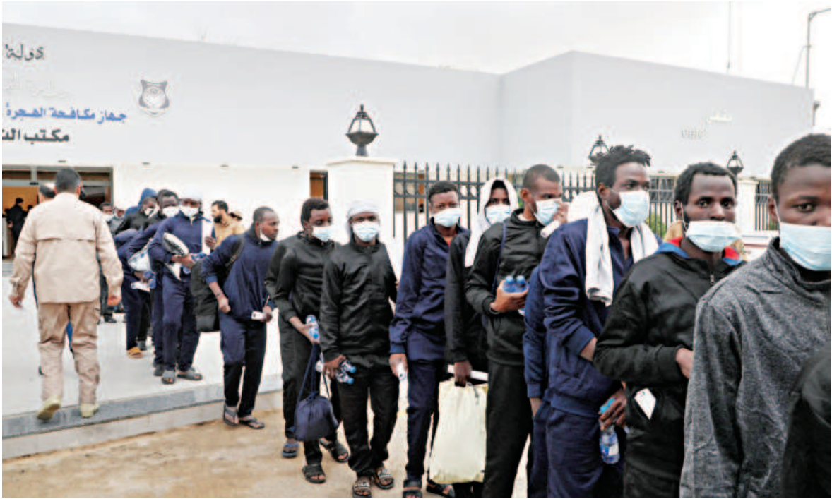
Illegal migrants from Niger wait during a deportation operation in the Libyan capital of Tripoli yesterday. In the past few years, Libya and Tunisia have turned into North Africa's most popular departure points for migrants from sub-Saharan countries.