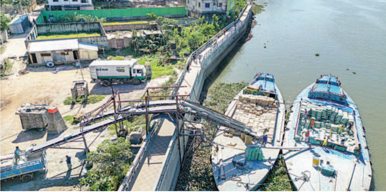
The walkway by the Turag River in the capital's Ramchandrapur was built not only for people to enjoy daily strolls, but also to stop illegal encroachment of the banks while protecting the demarcation pillars. However, some cement companies have illegally constructed a structure right on the walkway to unload cement, which is not only obstructing pedestrian movement but also posing risks to the walkway's structural integrity. The photo was taken recently.

"Cadre officials are among the highest beneficiaries and most responsible officers of the state. If they resort to protests, threaten mass rallies, and engage in such movements, what lessons will the people or