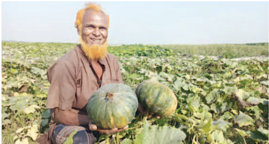
Like him many farmers in the region are happy as harvesting of early variety pumpkin has given them opportunity to earn good money. The photo was taken from Mahipur in Rangpur’s Gangachara upazila.