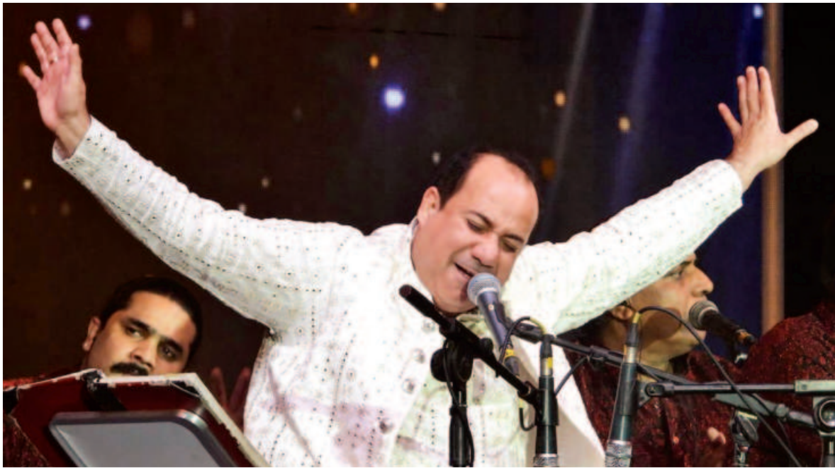
Celebrated Pakistani artiste Rahat Fateh Ali Khan performs at the BPL Music Fest at the Sher-e-Bangla National Cricket Stadium in Mirpur yesterday. A seven-hour-long musical show, also featuring local musicians and bands such as Xefeer, Avoid Rafa and Miles, kicked off the first event of the music fest as part of Festival of Youth 2025.