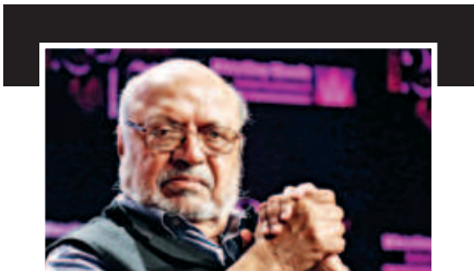
SHYAM BENEGAL (1934-2024)