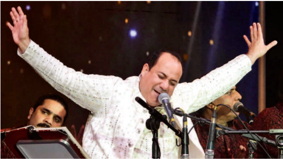
Celebrated Pakistani artiste Rahat Fateh Ali Khan performs at the BPL Music Fest at the Sher-e-Bangla National Cricket Stadium in Mirpur yesterday. A seven-hour-long musical show, also featuring local musicians and bands such as Xefer, Avoid Rafa and Miles, kicked off the first event of the music fest as part of Festival of Youth 2025.