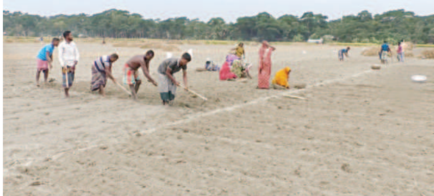
Many growers, who prepared their lands for potato farming, face acute seed crisis. The photo was taken from Barguna's Patharghata upazila.