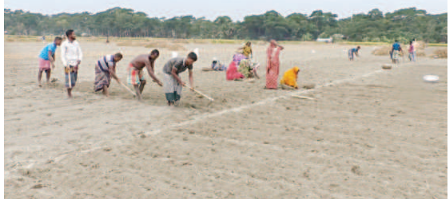
Many growers, who prepared their lands for potato farming, face acute seed crisis. The photo was taken from Barguna's Patharghata upazila.

One of Gaza's few still partially functioning hospitals, on its northern edge, an area under intense Israeli military pressure for nearly three months, sought urgent help after being hit by Israeli fire.