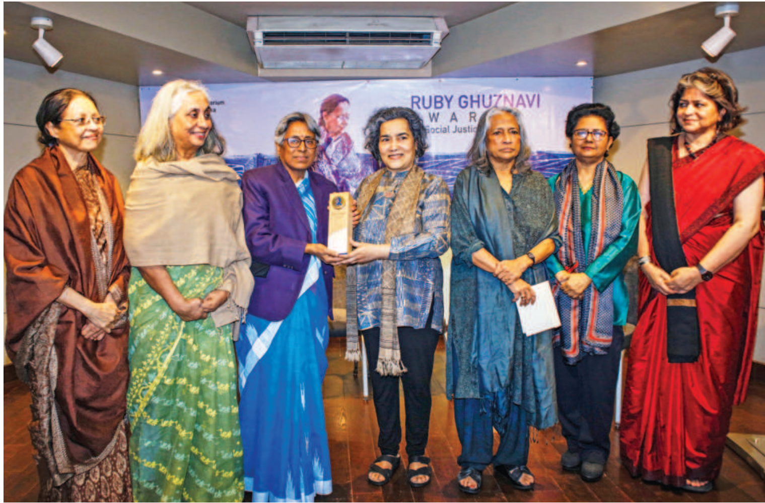
Naripokkho received the "2023 Ruby Ghuznavi Award for Social Justice" yesterday, in recognition of its long-standing work with the Biranganas, the war heroines of Bangladesh's Liberation War in 1971. The award was presented at a ceremony held at the BRAC Centre in the capital.