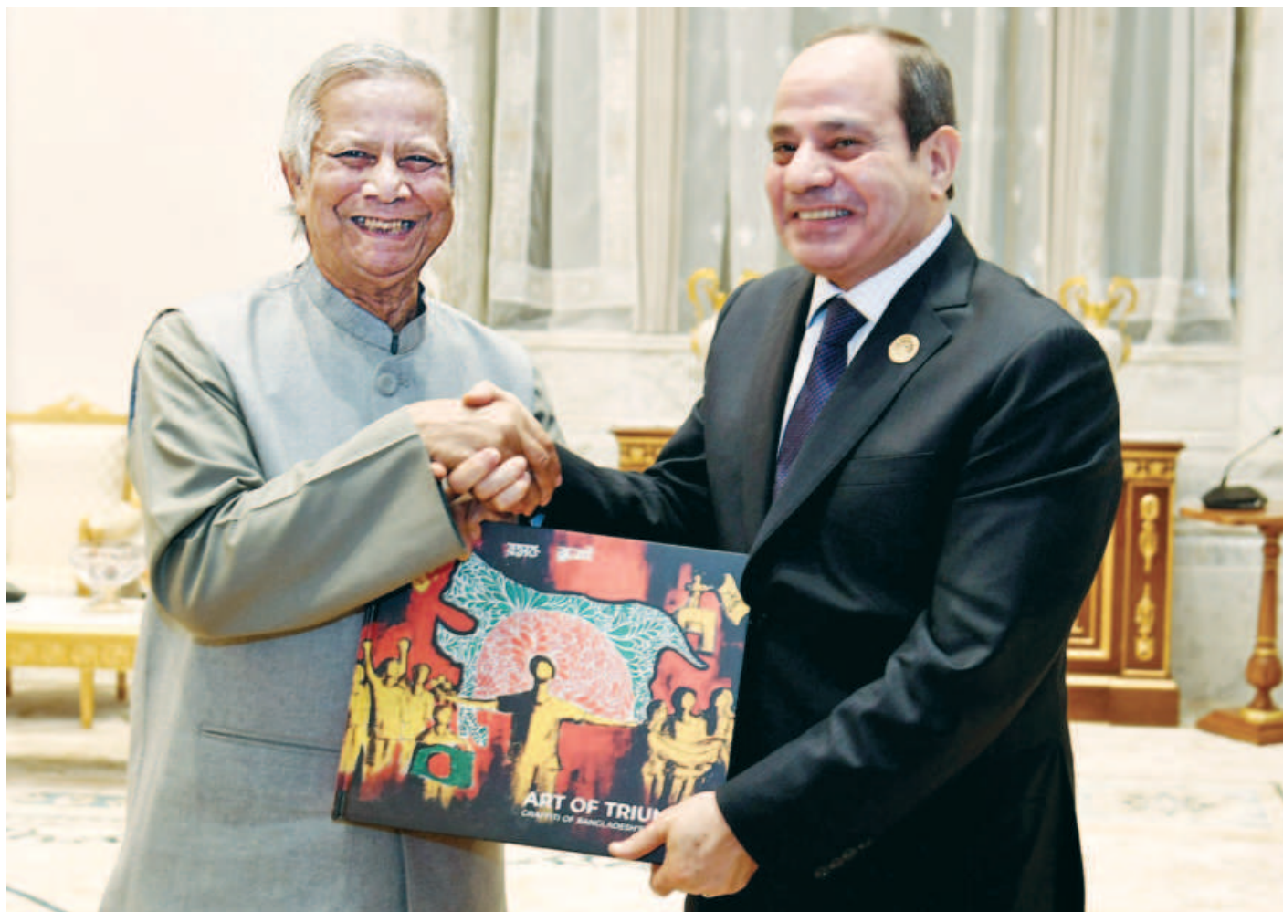
Chief Adviser Professor Muhammad Yunus presents the "Art of Triumph", an artbook prepared by Bangladeshi students after the July mass uprising, to Egyptian President Abdel Fattah El-Sisi. The photo was taken at the Presidential Palace in Cairo on Thursday.