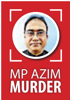
MP AZIM MURDER

Authorities in both countries continue their investigation into the high-profile case.