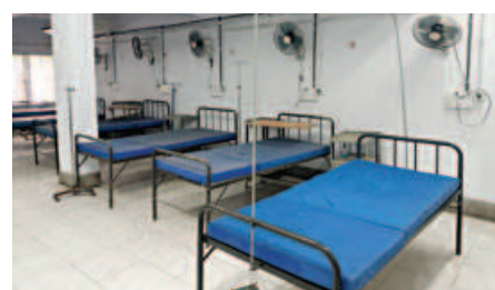
Empty beds at the high-flow oxygen ward at Dhaka Mohanagar General Hospital.