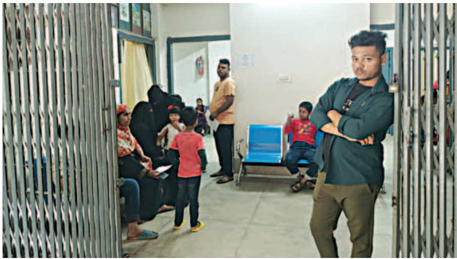
Service seekers wait for a long time at the outpatient department of Dhaka Metropolitan Children's Hospital.

Patients, many of whom rely on these hospitals as their sole recourse for treatment, often find themselves waiting for hours, even days, for attention, while doctors and nurses are stretched too thin to offer the level of care that's desperately needed.