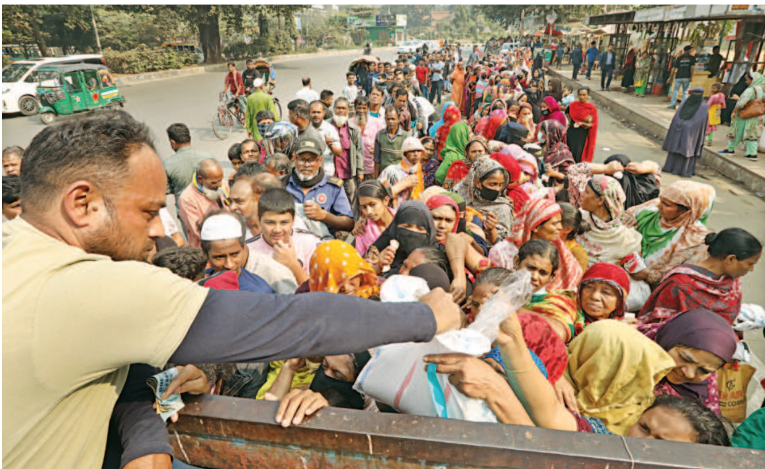
Scores of people from the low-income group had been waiting near the TNT field in the capital's Khamarbari for the TCB truck, so that they could purchase kitchen essentials at subsidised prices. However, as the truck arrived around 12:00pm and distribution went on till late in the afternoon, many missed the chance to go home and cook lunch for their families. The photo was taken yesterday.