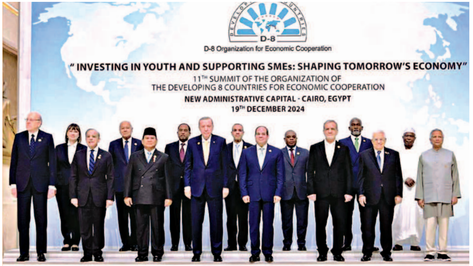
Chief Adviser Prof Muhammad Yunus and other D-8 leaders pose during a photo session at the D-8 summit at the New Administrative Capital of Egypt yesterday.