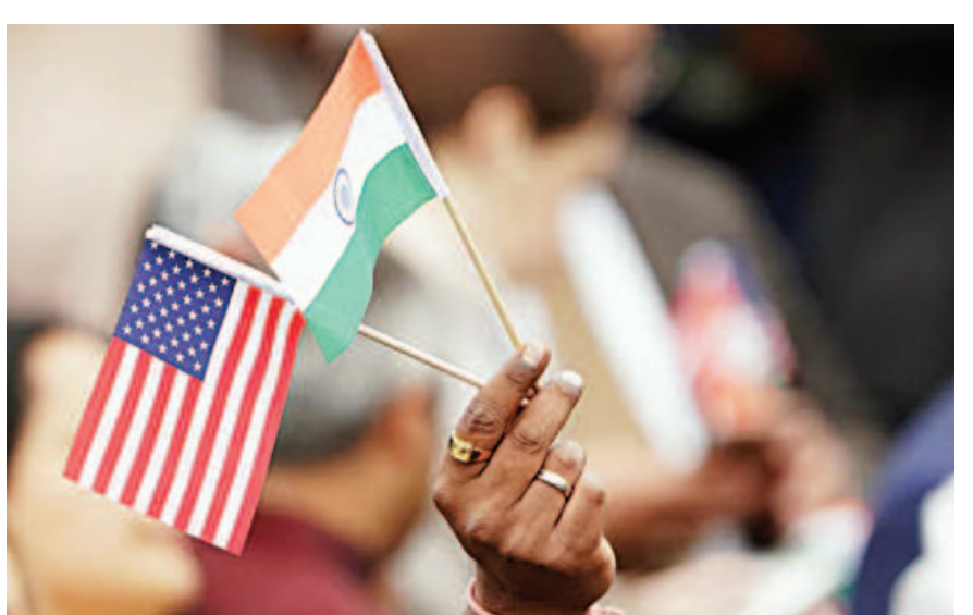
To tackle Trump's threat of a "reciprocal tax" on Indian goods for high tariffs, some officials of the Indian commerce ministry are ready to consider cuts on certain products.

To address Trump's concerns over including crude oil, refined fuel and coal. were estimated at $12 billion in fiscal 2024, and aircraft and parts at $2 billion. Such imports could rise by $5 billion to $10 billion annually, a third government