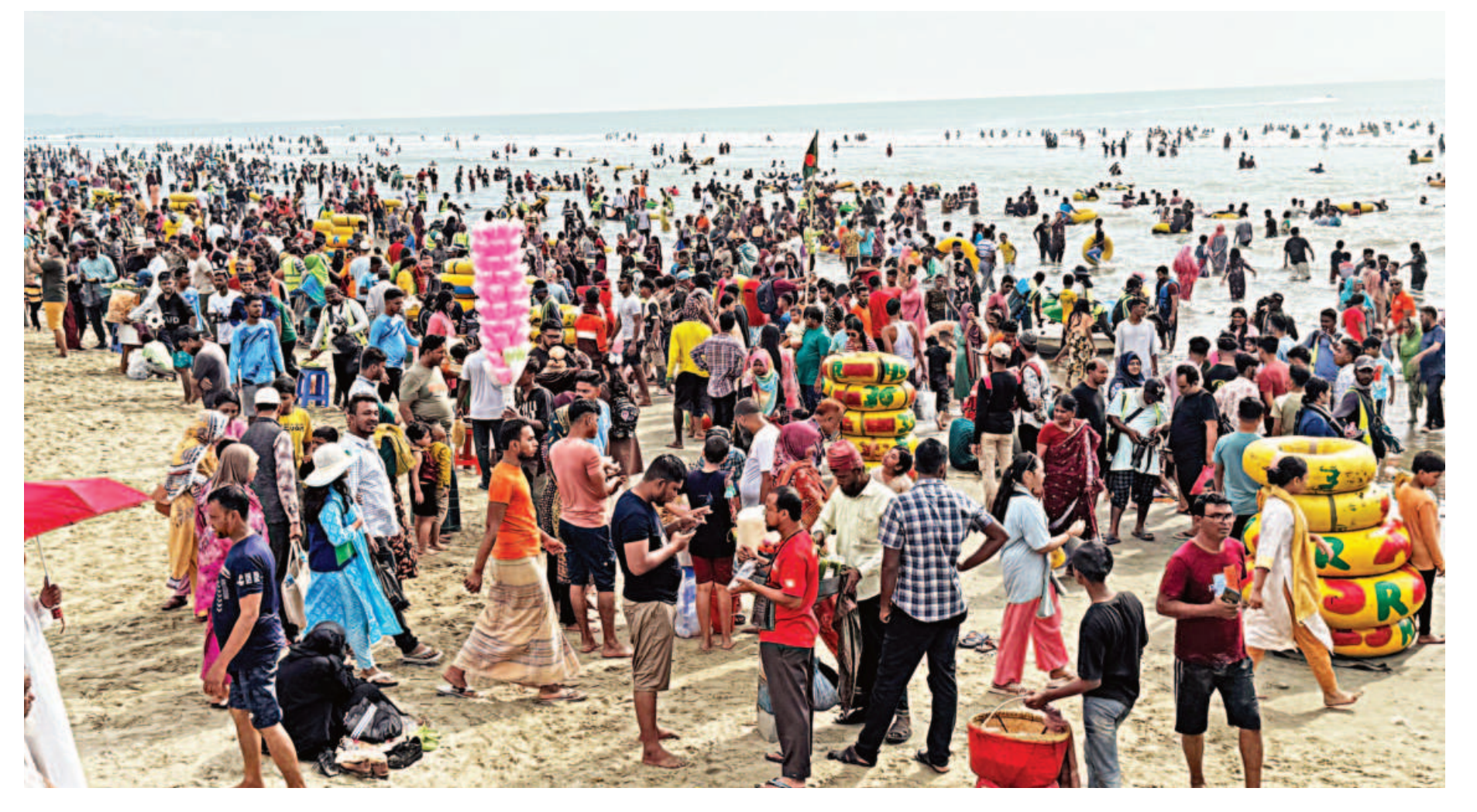
The beaches of Cox's Bazar are currently teeming with visitors as people from all over Bangladesh are flocking to the popular tourist spot to enjoy their winter vacation. The situation is similar at other destinations in the country, breathing much-needed life into the domestic tourism industry.