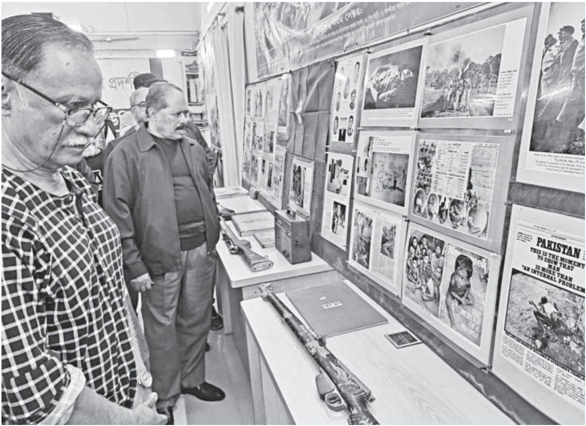
Marking Victory Day, Barishal Reporters Unity organised a two-day exhibition on the 1971 Liberation War at its office, which ended yesterday.

Bangladesh FROM PAGE 3 as a dynamic platform for fostering confidence and cooperation, saying its success in addressing various global challenges and its positive impact on economic, environmental, and humanitarian issues. Bangladesh, a member since 2014, reaffirmed its commitment to CICA and its readiness to contribute, particularly in the fields of information technology, natural disaster management, and environmental protection, where it currently co-chairs CICA's initiatives. The meeting also marked the handover of CICA's chairmanship from Kazakhstan to Azerbaijan for the next two years. The gathering, attended by foreign ministers and heads of international organisations, adopted a statement commemorating the 25th anniversary of CICA's founding principles.