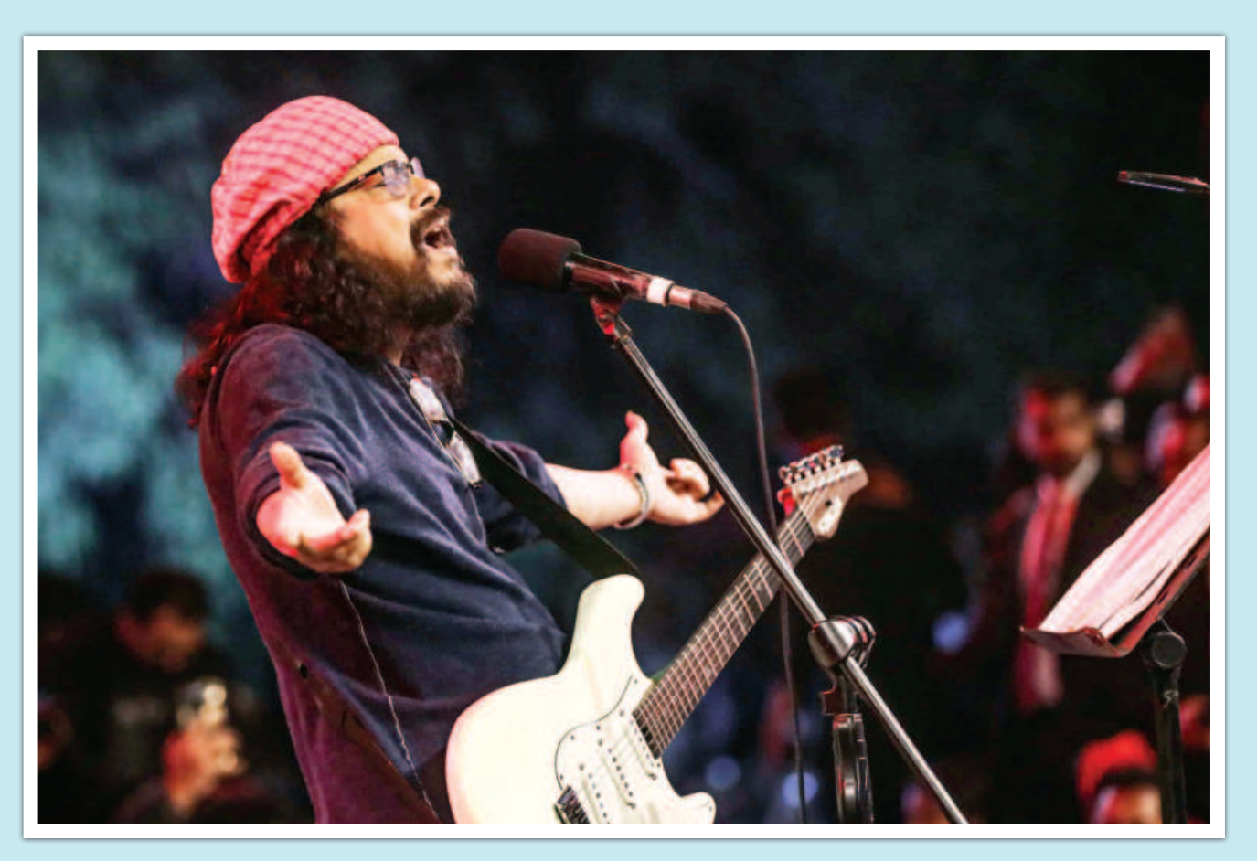
The "guru of Bangla rock" James puts the audience on their feet as Nagar Baul takes to the stage at the "Shobar Agey Bangladesh" concert at the capital's Manik Mia Avenue vesterday.